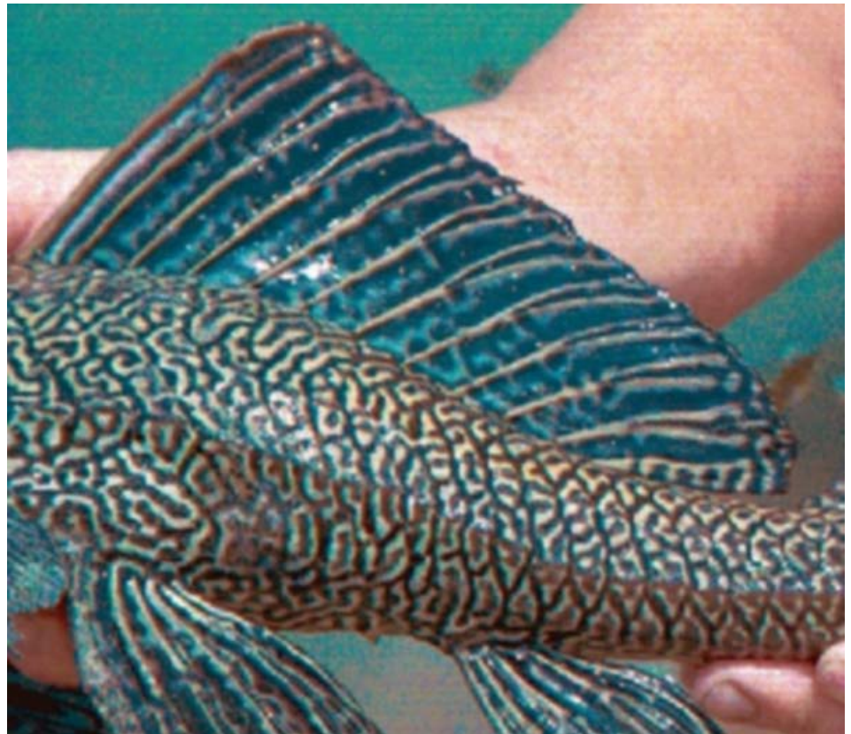
Figure 4. Sailfin catfish from Espada Lake, Texas. The large dorsal fin has a single spine and 11 rays.

Like armadillo del rio, these fishes construct burrows in the banks of the rivers and lakes in which they live (Figure 5). Burrow width approximates that of the occupant fish (i.e., width between extended pectoral fins), burrow length is typically 0.5 to 1.0 m, and shape is variable although the tunnel usually extends downward into the bank (Devick 1988). These burrows are