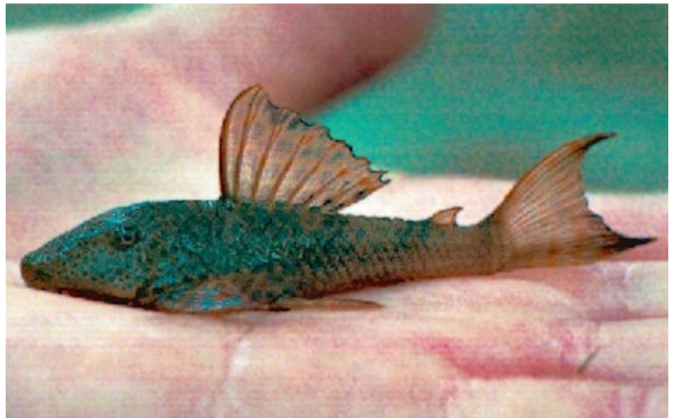
Figure 3. Armadillo del rio from the San Antonio River at the San Antonio Zoo. The small dorsal fin has a single spine and seven rays

Fishes in the genus Hypostomus ( Plecostomus in older references)