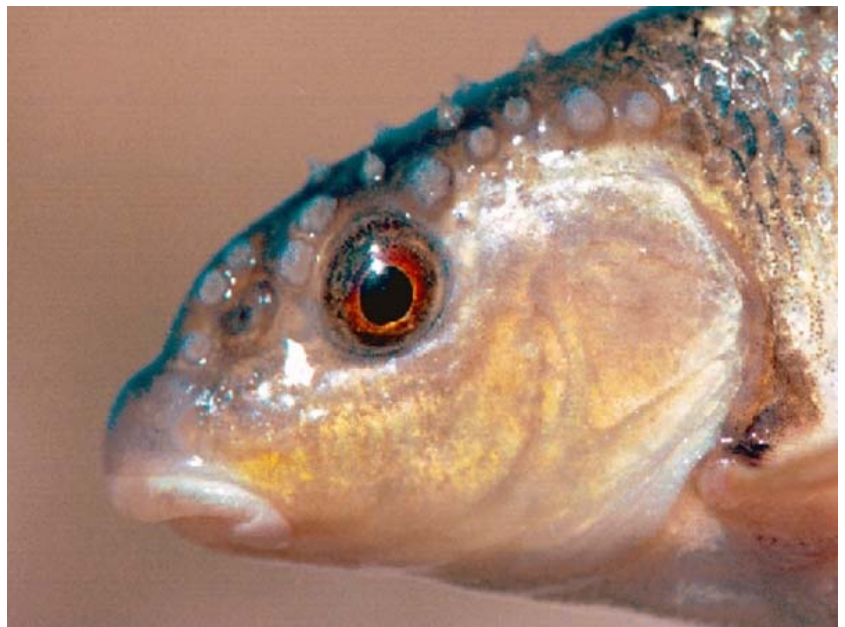
Figure 8. Central stoneroller, Campostoma anomalum , a native herbivore threatened by suckermouth catfishes. The ventrally positioned (inferior) mouth has a cartilaginous ridge on the lower jaw used to scrape off attached algae on which the fish feeds. The hooked horns on the dorsal surface of the head are breeding tubercles of the male, which will be lost shortly after spawning

mentally tolerant species that feed on the same foods that they do. Because they are bottom feeders, suckermouth catfishes may incidentally ingest eggs of native fishes. Because they are benthic and