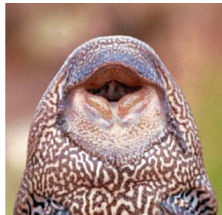
Figure 2. Mouth of a sailfin catfish. The thick, fleshy lips form a sucking disc for attaching to rocks and grazing on algae

benthic, adhering to streambeds and rocks with their mouths. They are vegetarians feeding on detritus and algae. Feeding is done by plowing along the substrate and using the thick-lipped, toothy mouth to scrape plant materials (filamentous algae, diatoms) from hard surfaces or to