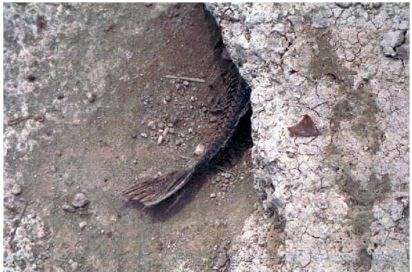
Figure 6. Sailfin catfish in de-watered burrow