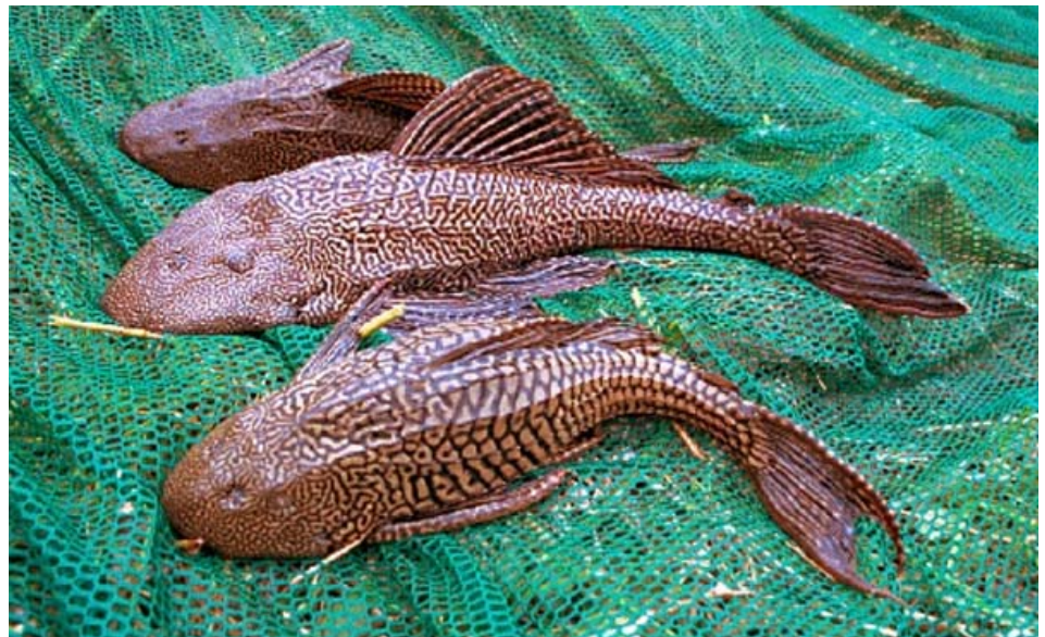
Figure 1. Suckermouth catfishes from the San Antonio River at Lone Star Boulevard, San Antonio, Texas. These are sailfin catfishes and are believed to represent three species: Pterygoplichthys anisitsi (foreground), P. disjunctivus (middle), P. multiradiatus (background)

In appearance and in habits, the suckermouth catfishes or “plecos” of South and Central America ( Loricariidae ) are markedly different from the bullhead catfishes of North America ( Ictaluridae ). Bullhead catfishes are terete and naked, with a terminal mouth and a spineless adipose fin. They are free-swimming predators that feed on invertebrates and other fishes. Suckermouth catfishes, in contrast, are flattened ventrally, their dorsal and lateral surfaces covered with rough, bony plates forming flexible armor (Figure 1). Because of this armor, suckermouth catfishes are sometimes referred to as “mailed” catfishes (Norman 1948). The mouth is inferior and the lips surrounding it form a sucking disc (Figure 2). The adipose fin has a spine. The caudal fin is frequently longer ventrally than dorsally. Pectoral fins have thick, toothed spines which are used in male-to-male combat and locomotion (Walker 1968). Suckermouth catfishes are