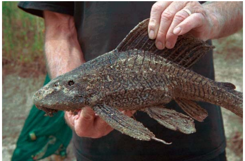
Figure 7. Sailfin catfish extracted from de-watered burrow. Eyes are sunken into the sockets and surface is dry to touch indicating prolonged aerial exposure. Specimen recovered, however, when returned to the river, ventilating and moving almost immediately, and swimming off into deep water several minutes later

Native herbivorous North American fishes, like the central stoneroller ( Campostoma anomalum ) and the Florida flagfish ( Jordanella floridae ), are small (less than 12 cm) minnows or minnow-like fishes, with comparatively short lifespans (less than 4 years), low fecundity, and limited resistance to hypoxia and desiccation (Figure 8). Consequently, they are at a competitive disadvantage when confronted by larger (greater than 15 cm), longer-lived, highly productive, environ-