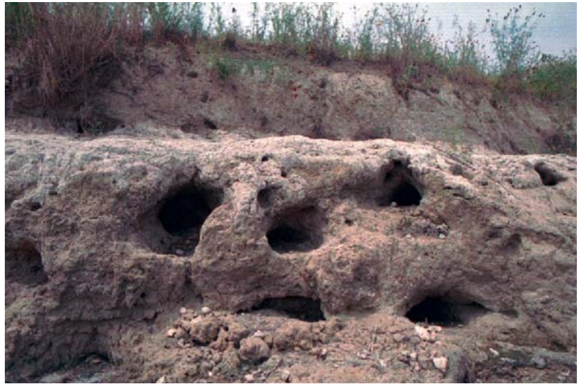
Figure 5. Burrows of sailfin catfishes in the San Antonio River, Texas