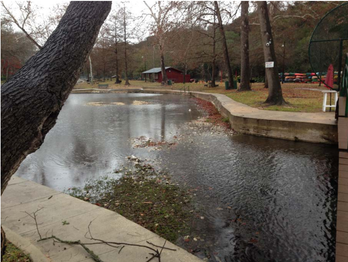
Figure 4: Improved water levels in the eastern outfall of Spring Island.