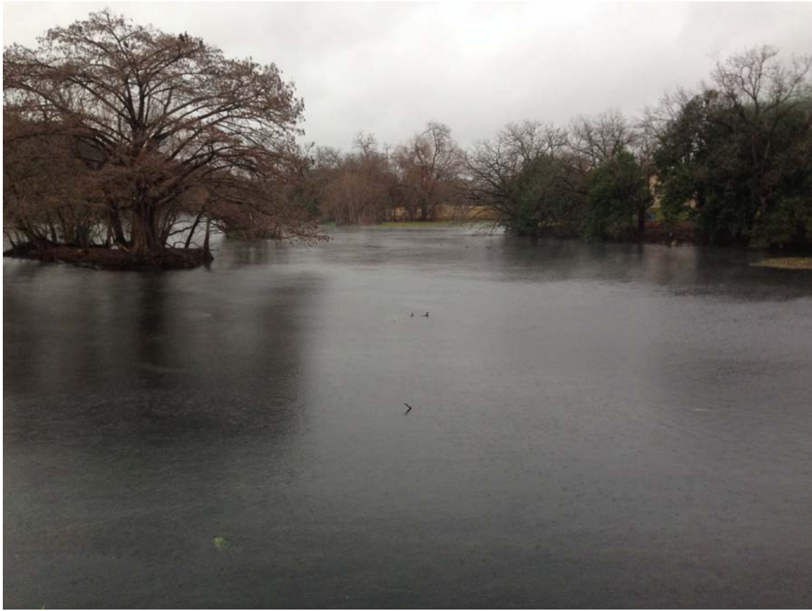
Figure 6: Aquatic vegetation mats mostly gone from Landa Lake.