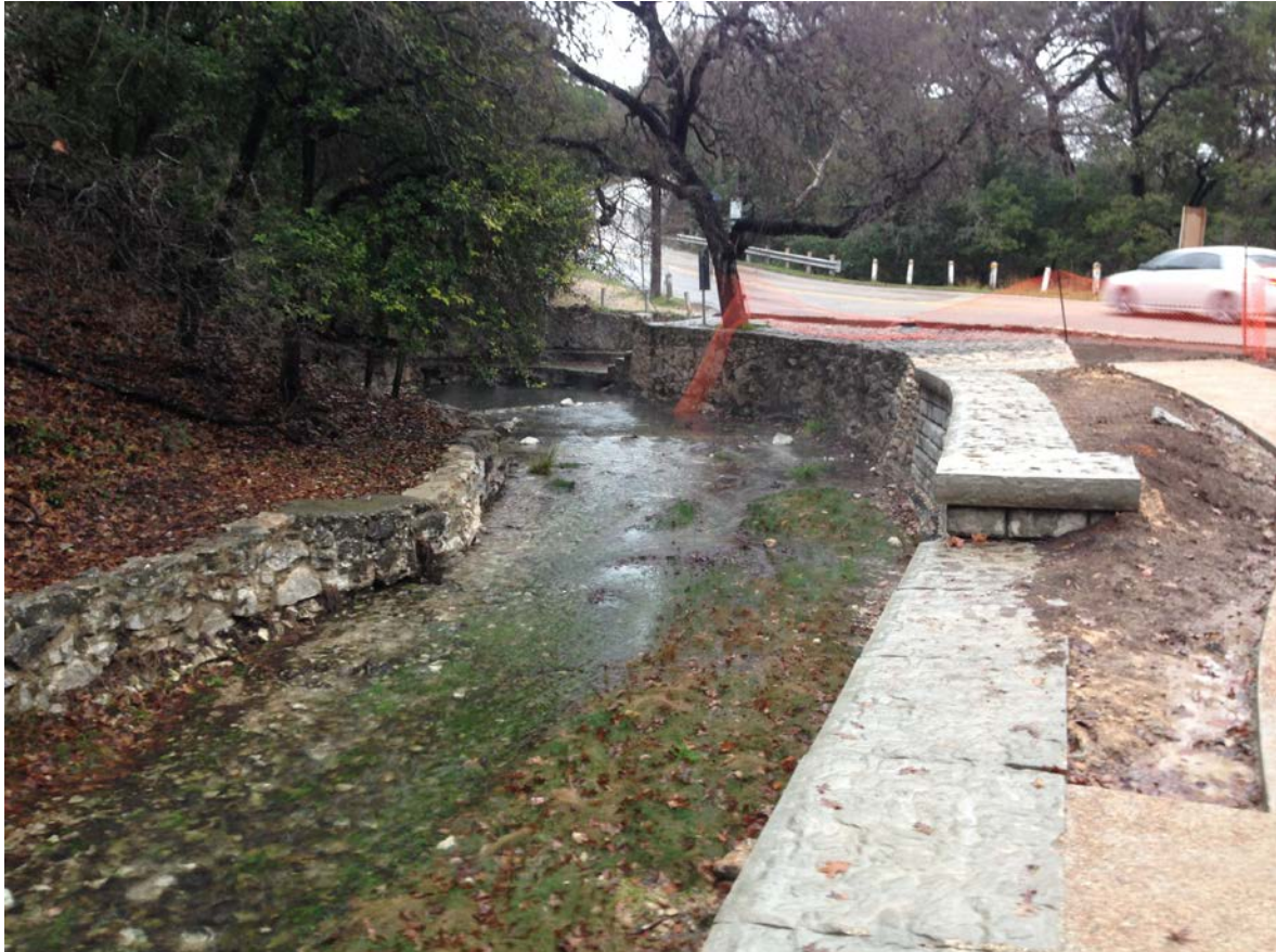
Figure 3: Spring Run 1 surface flow.