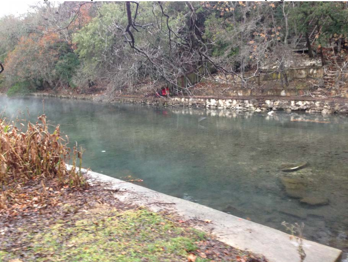
Figure 5: Little aquatic vegetation in the Upper Spring Run reach.