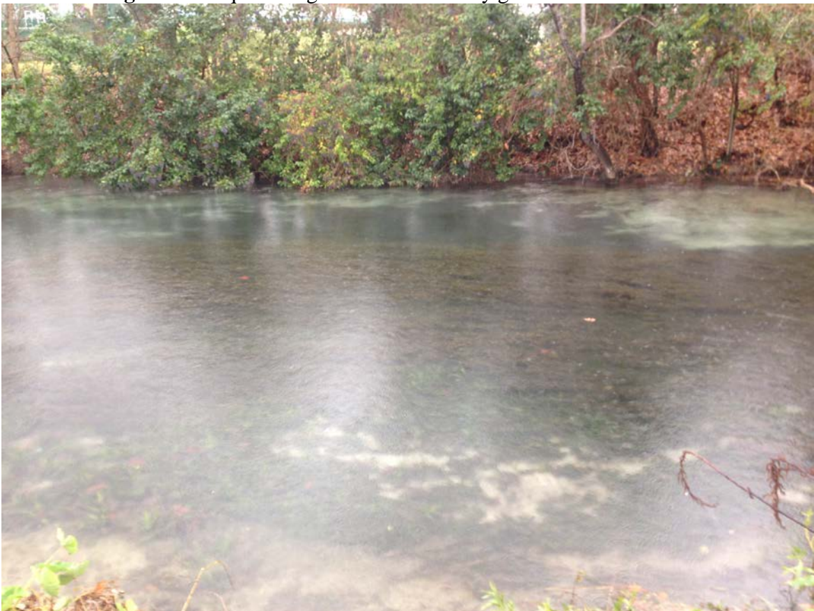
Figure 7: Restored native aquatic vegetation in the Old Channel.