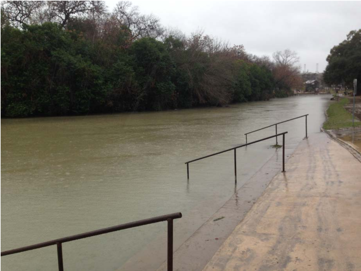
Figure 8: Turbid conditions in the New Channel Reach on a rainy morning.

In summary, water level conditions and wetted surface habitat were improved considerably this week due to the increase in total system discharge. However, relative to average flow conditions, endangered species habitat continues to be impacted for surface dwelling invertebrates in the spring runs, western shoreline, and Spring Island areas. Impacts to fountain darter habitat are mostly restricted to areas in the Upper Spring Run, but darters are still present throughout the system. Floating aquatic vegetation mats in Landa Lake were greatly improved thanks to the recent pulse in water levels. Increased turbidity from recent rain did not allow for a visual diagnosis of habitat conditions in the New Channel, but little change from the previous week is expected. Quality fountain darter habitat persists in Landa Lake and the Old Channel thanks in part to ongoing aquatic vegetation restoration activities.