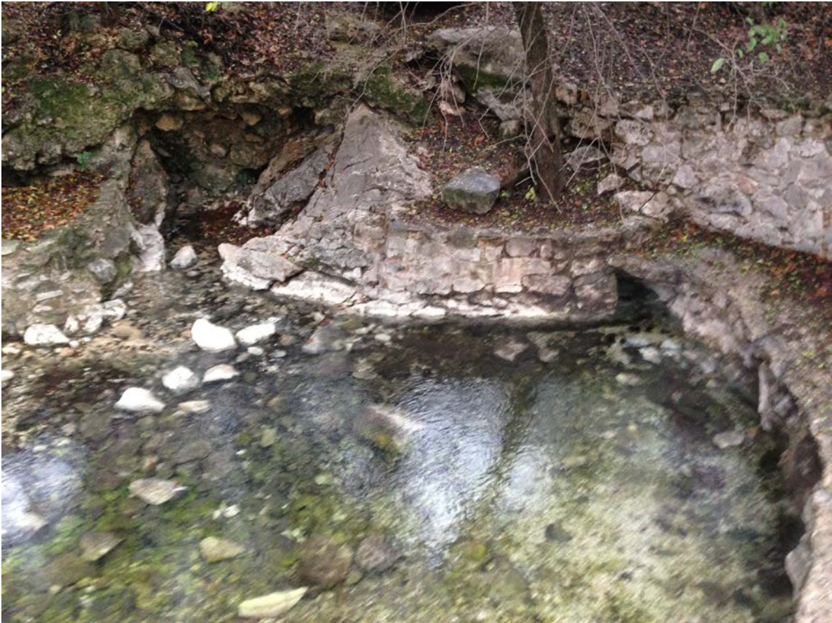
Figure 2: Headwaters of Spring Run 1 with both major orifices flowing.