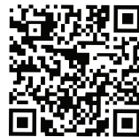
Side A Hat Piece