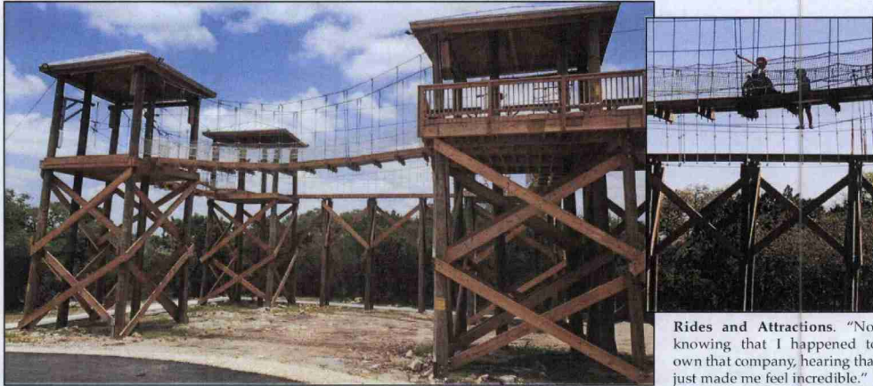
The elevated challenge course is made for fully abled and physically challenged participants to interact side by side.

With the Morgan's Wonderland Inclusion Foundation established in 2020, the mission has com-