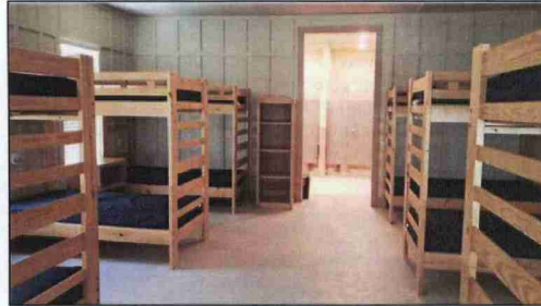
Lower bunks have been designed to allow easy transfer of wheelchairs.

"We're really big about community-based instruction," said Mouton. "Eventually that will grow, and we can have groups from