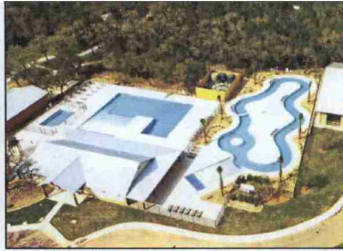
Regardless of physical ability, the system on the rock wall allows everyone to try (above left). All water activities offer zero entry (above right). A climate controlled pool adds to the accessibility.