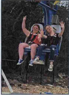
Morgan's Wonderland Camp is part of a nonprofit organization. A Soaring Eagle zipline (above right) was tweaked to accommodate all riders.