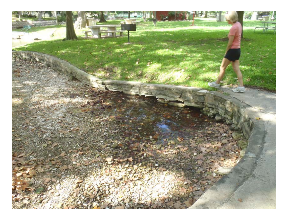
Figure 3: Small pool in headwaters of Spring Run 6.