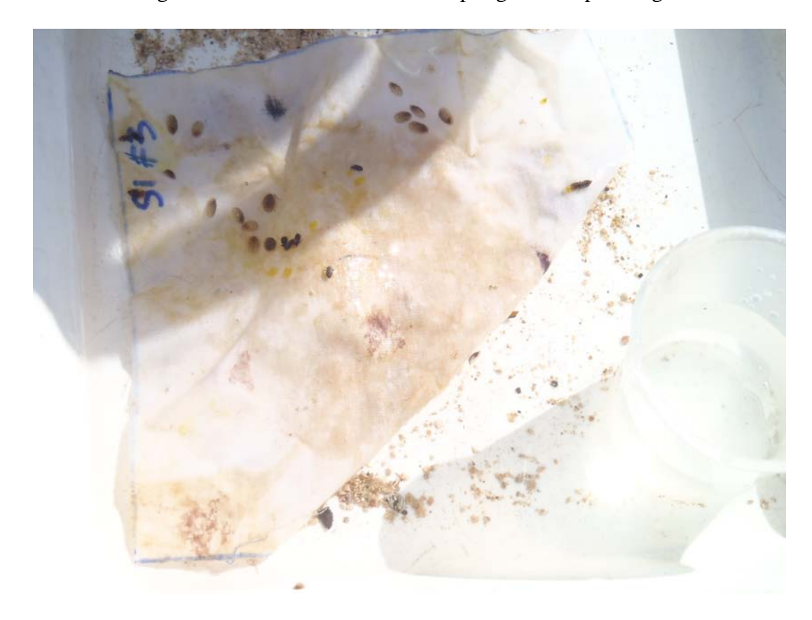
Figure 6: Cotton lure from Spring Island after a four-week set.