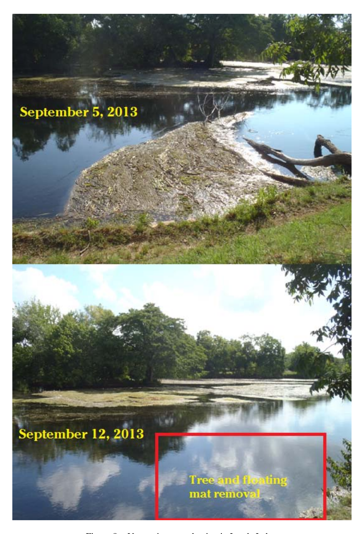
Figure 8: Vegetation mat clearing in Landa Lake.