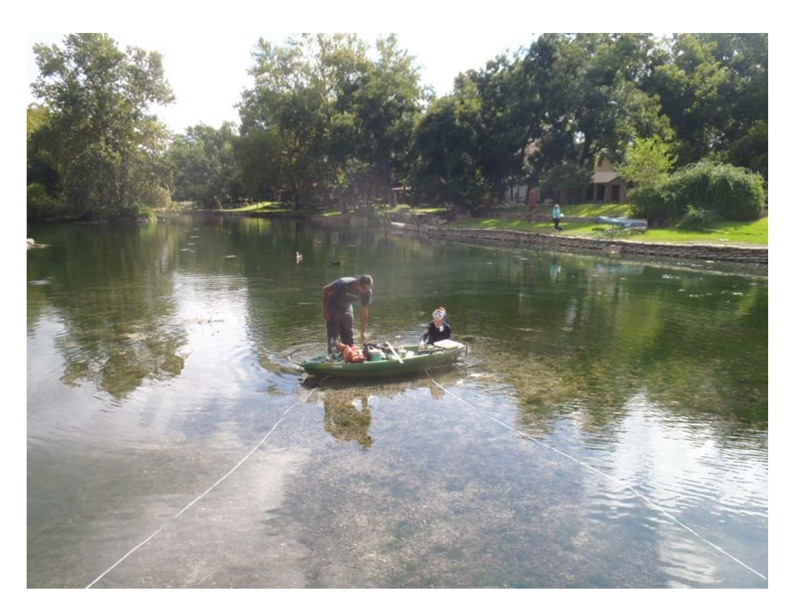
Figure 5: Cotton lure retrieval at Spring Island upwellings.