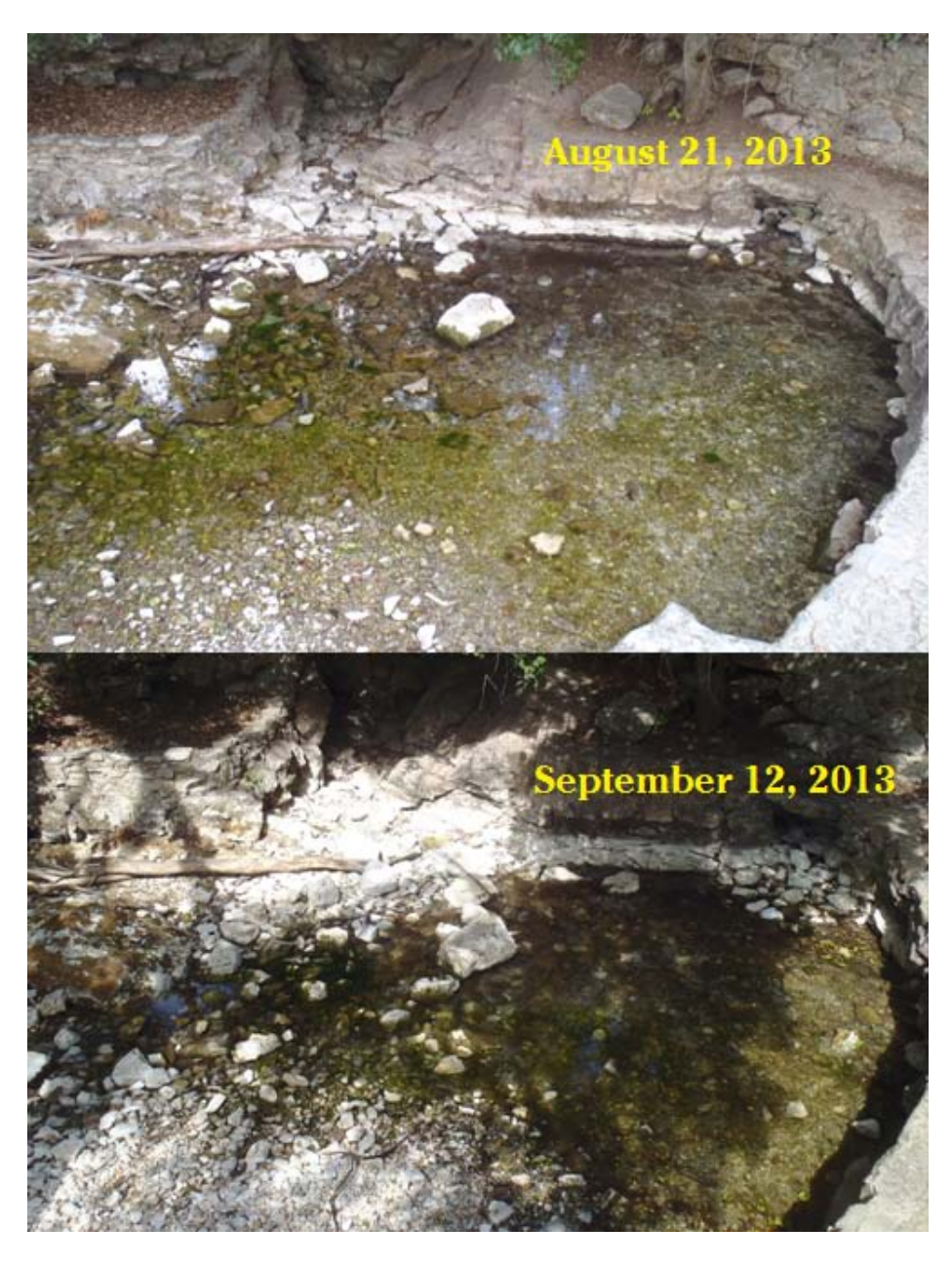
Figure 1: Spring Run 1 comparison (August 21<sup>st</sup> versus September 12<sup>th</sup>, 2013).

As evident in the Table above, flow within the spring runs continues to be quite low. As in weeks past, flow continues to go subsurface near the headwaters of spring runs 1 and 2. The following figure highlights the difference in the Spring Run 1 headwater from August 21<sup>st</sup> to September 12<sup>th</sup>.