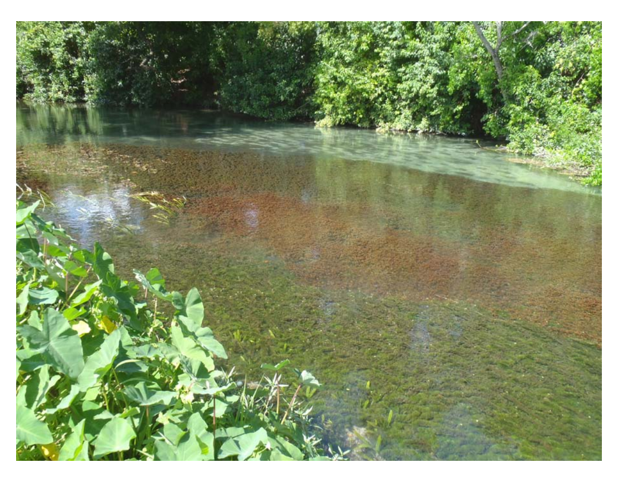
Figure 9: Restored aquatic vegetation in Old Channel.