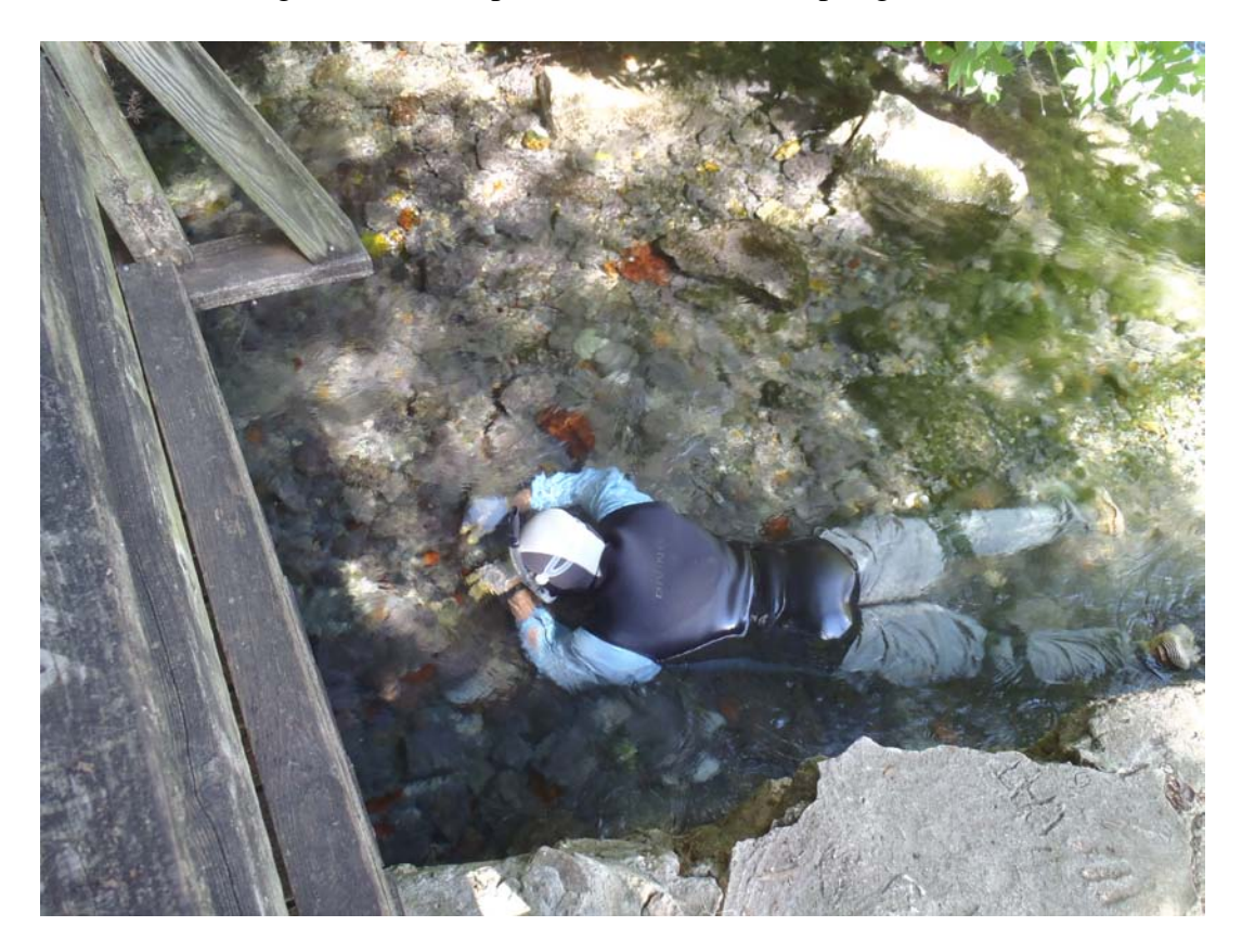
Figure 4: Salamander surveys in Spring Run 3.