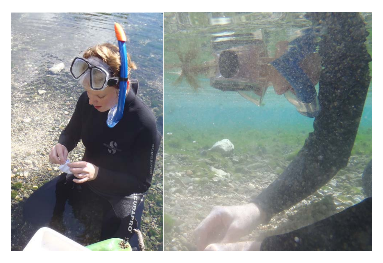
Figure 7: New cotton lure reset at Spring Island Upwelling.

Similar to each previous August/September memorandum, fountain darter habitat conditions in Landa Lake remain favorable with multiple spring upwellings and bryophyte patches both on their own and intermixed within other vegetation types. The City of New Braunfels conducted floating vegetation mat removal with notable improvements (Figure 8) this week but additional attention is still needed. In addition to the lake, fountain darter habitat continues to prosper in the Old Channel (Figure 9) and New Channel (Figure 10 – note the Cabomba patch in the background of the suckermouth catfish). As per the Section 6.3.4 of the HCP (< 150 cfs trigger), presence absence dip netting for the fountain darter will next occur in October, or when total discharge declines below 100 cfs.