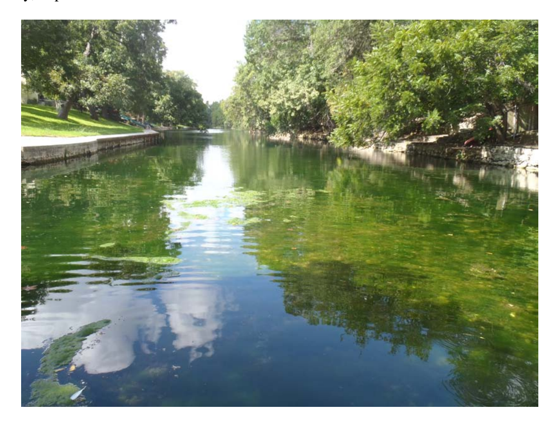
Figure 2: Algal build up adjacent to and downstream of Spring Run 5 in the upper spring run reach.

Spring run 3 continues to maintain upwelling and horizontal flow from the headwaters with surface connectivity to the entire spring run. It was again visually evident that upwelling flow is still coming from the Upper Spring Run reach. However, as documented in the Table above, flow in the upper reach has dropped to below 1 cfs. This is also very evident by the algal buildup that has occurred since last week's habitat evaluation (Figure 2). Note: All photographs were taken on Thursday, September 12<sup>th</sup> unless otherwise noted.