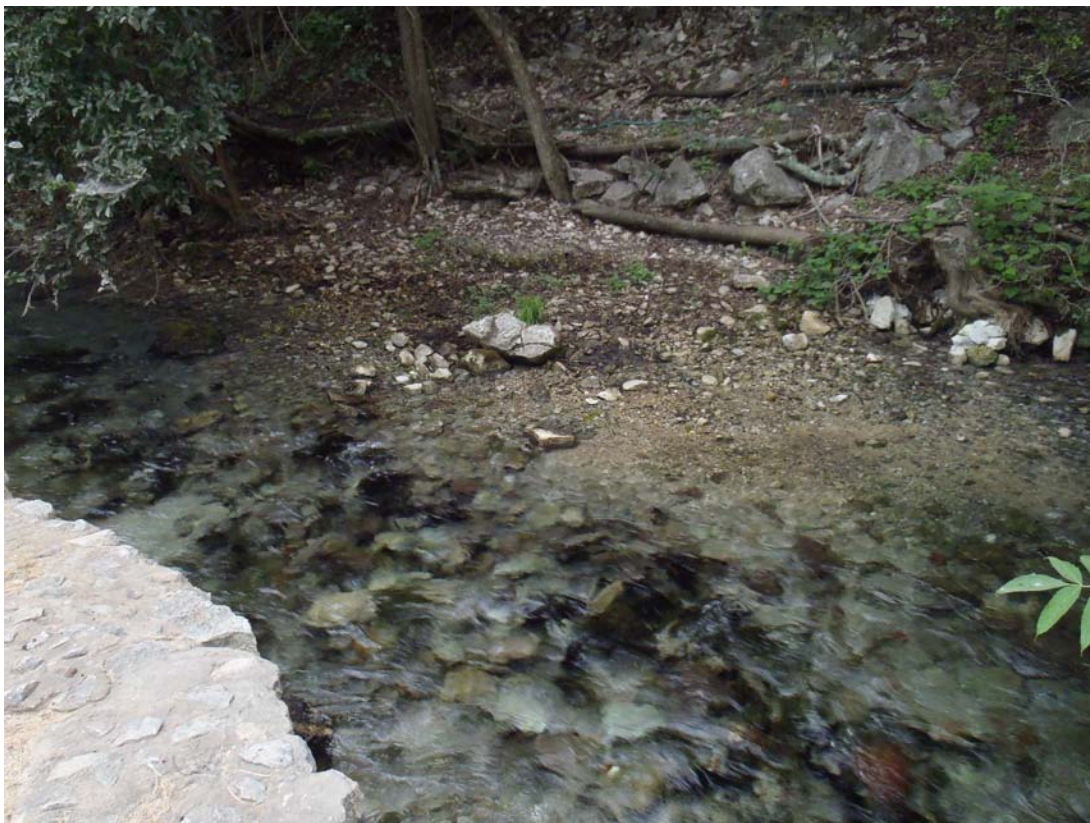
Figure 7: Spring Run 3 constricted area downstream.