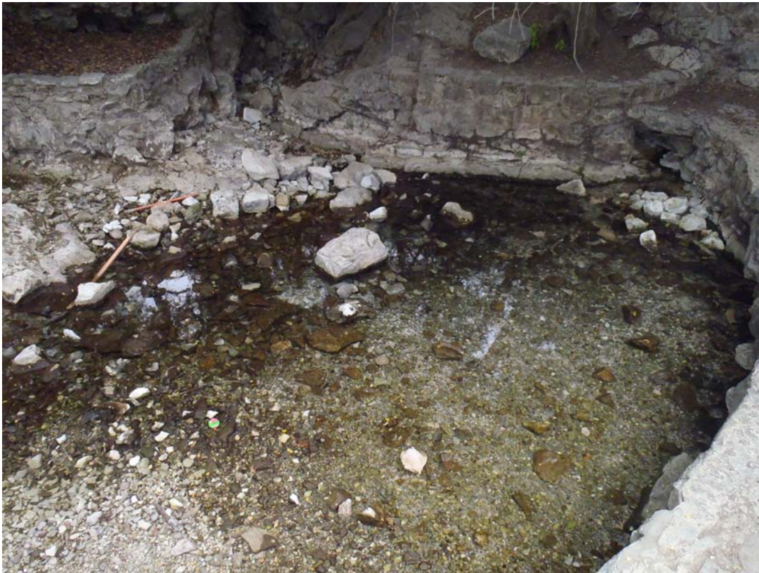
Figure 2: Spring Run 1 main orifices (upper left orifice has ceased surface flow).