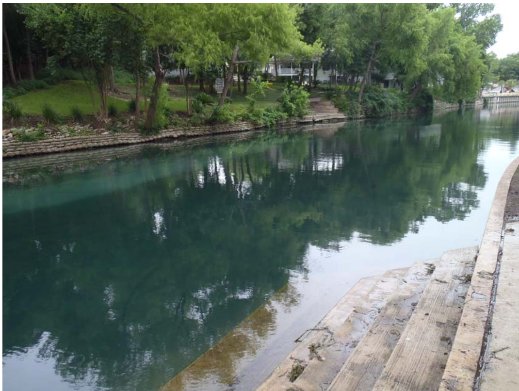
Figure 14: New Channel Cabomba continues to support quality fountain darter habitat.