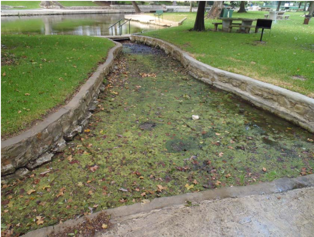
Figure 10: Southern spring run on Spring Island (only a few pools of standing water left).

Aquatic vegetation within Landa Lake continues to support quality fountain darter habitat. Floating vegetation mats in Landa Lake were again well controlled this past week (Figure 11) with the area above the fishing pier that was noted last week being completely cleared (Figure 12). Fountain darter habitat continues to hold strong throughout the Old (Figure 13) and New (Figure 14) channels.