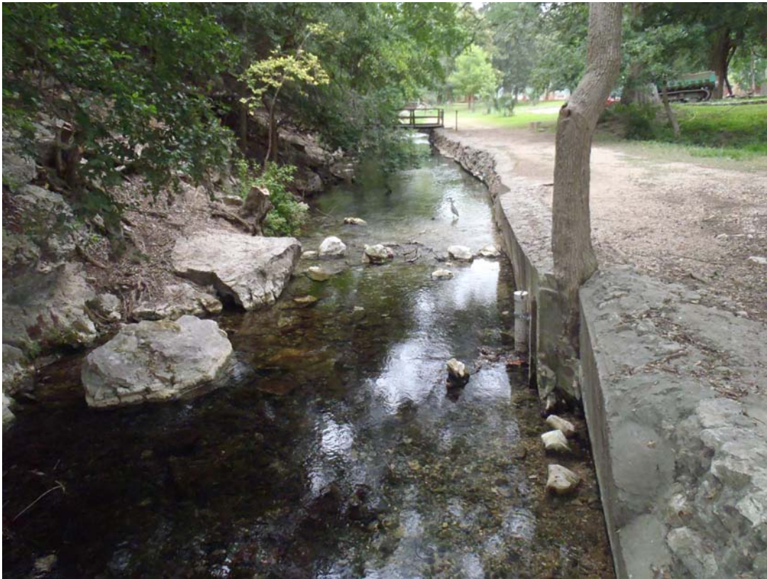
Figure 6: Spring Run 3 looking downstream from headwaters.