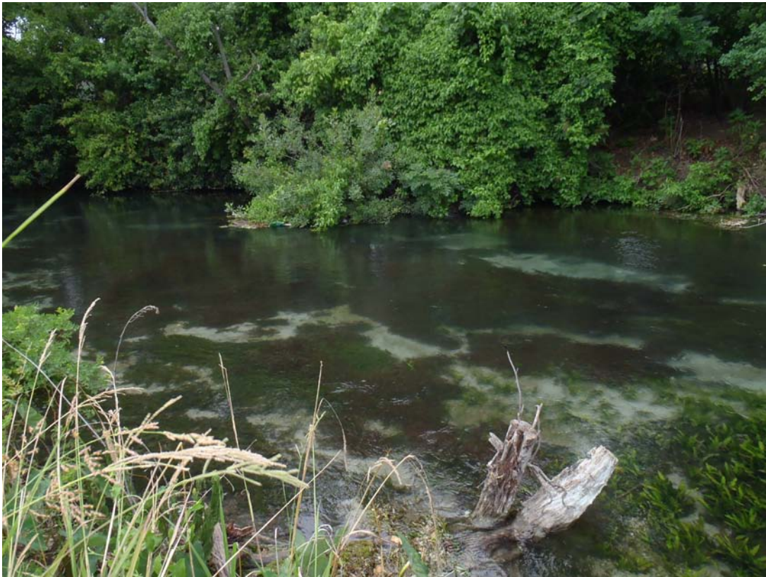
Figure 13: Restored native aquatic vegetation continues to thrive in the Old Channel.