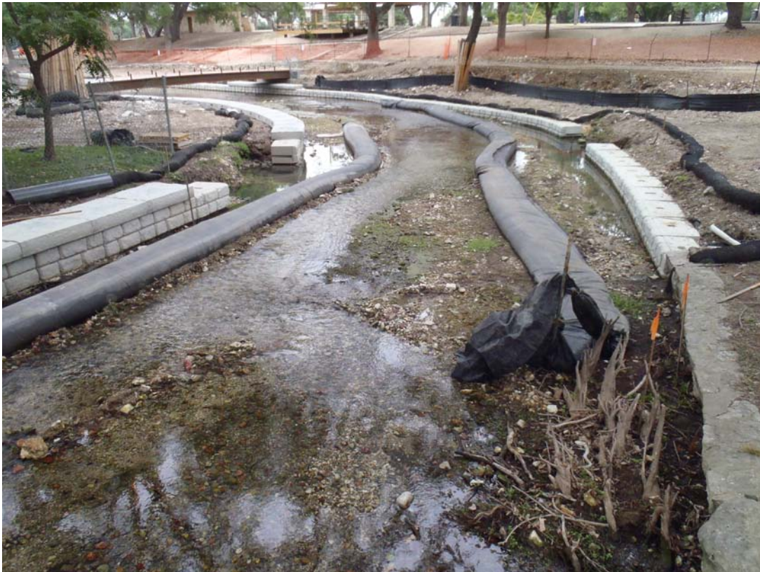
Figure 5: Spring Run 1 constricted channel looking downstream from Landa Drive.