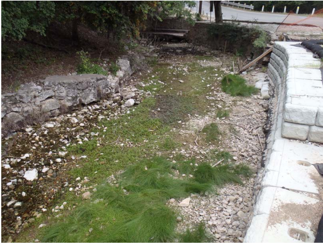
Figure 4: Highly constricted Spring Run 1 channel just downstream of where the surface flow in the channel resumes (photo taken looking upstream).