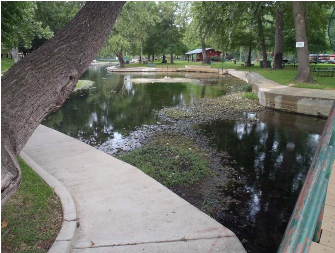
Figure 9: Continued exposed surface habitat adjacent to Spring Island.