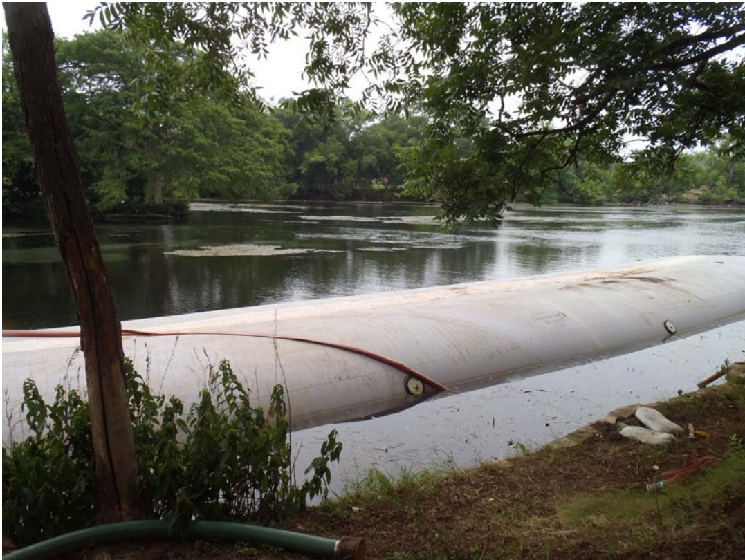
Figure 11: Floating aquatic vegetation mat condition in Landa Lake.