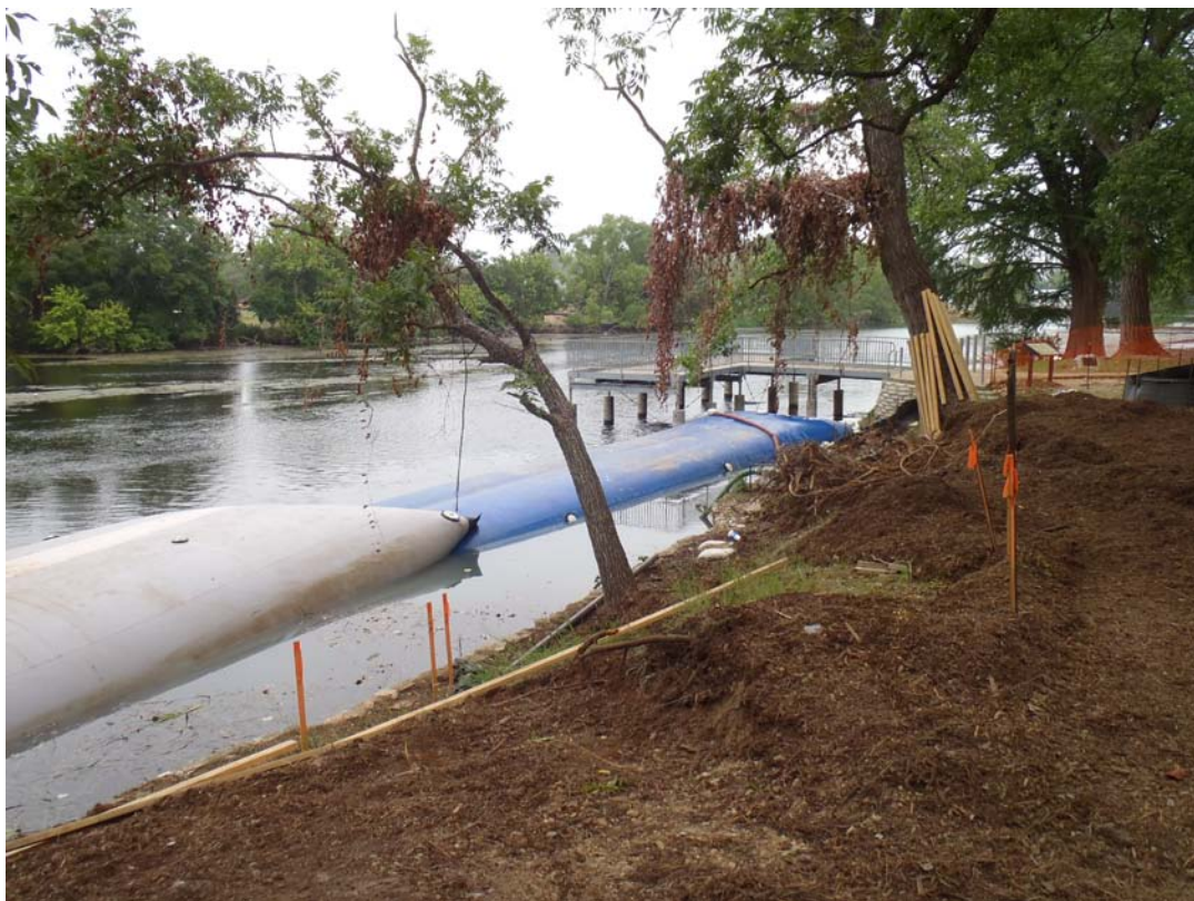
Figure 12. Landa Lake fishing pier (floating mats cleared from last week).