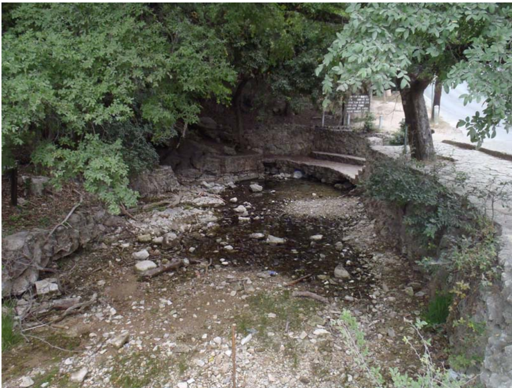
Figure 3: Spring Run 1 main channel looking upstream towards orifices (Presently, there is no surface connectivity to the main orifice pool).