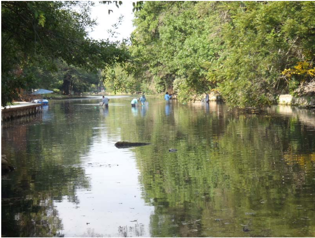
Figure 8: Algal coverage remains under control in the Upper Spring Run reach. Note: fountain darter collection effort for marking study evident downstream in photo.