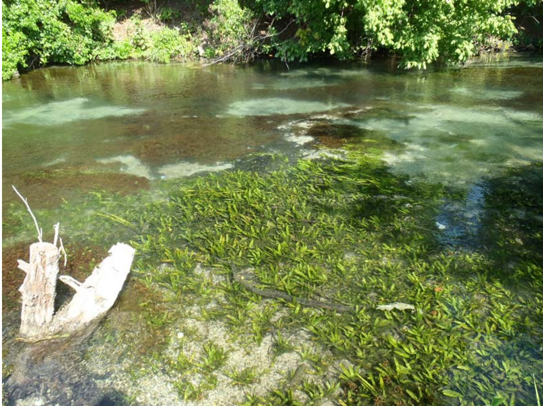
Figure 11: Restored native aquatic vegetation continues to thrive in the Old Channel.