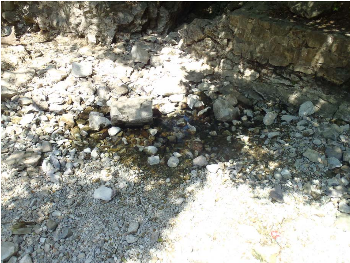
Figure 2: Spring Run 1 main headwater pool.