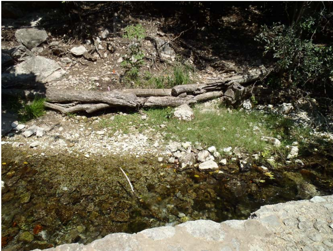
Figure 7: Spring Run 3 constriction just downstream of mid channel.

Surprisingly, the amount of green algae in the Upper Spring Run reach continues to be very low (Figure 8). Fisheries biologists conducting fountain darter marking collected well over 1,000 fountain darters of all sizes and tagged over 800 adult fountain darters from this reach on Thursday, August 7 th . Figure 9 shows the crew marking darters in the Upper Spring Run reach. The fact that so many darters continue to occupy this upper most reach when less than 3 cfs of total discharge has been flowing through it for over four months now is quite amazing. Additionally, there has been no documented movement (via the marking study) of darters out of this reach during this time period so far.