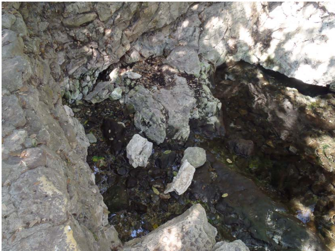
Figure 6: Spring Run 3 headwaters.