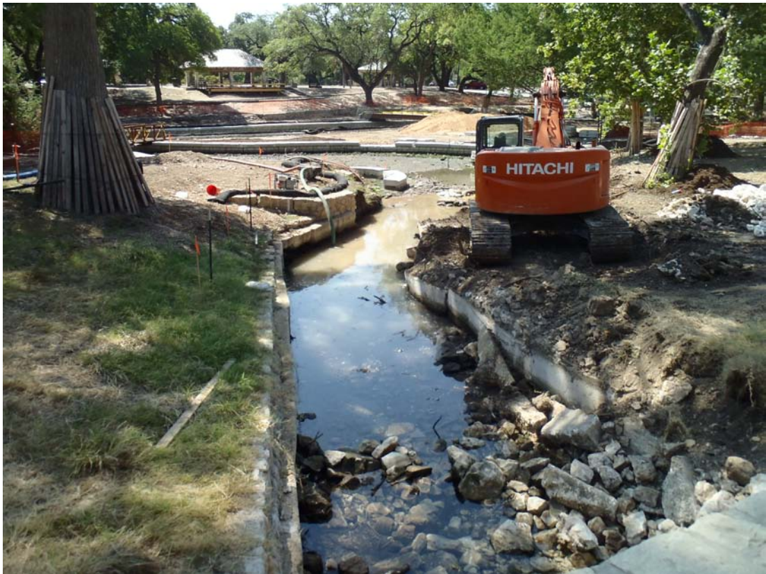
Figure 5: Spring Run 2 downstream of entrance road.