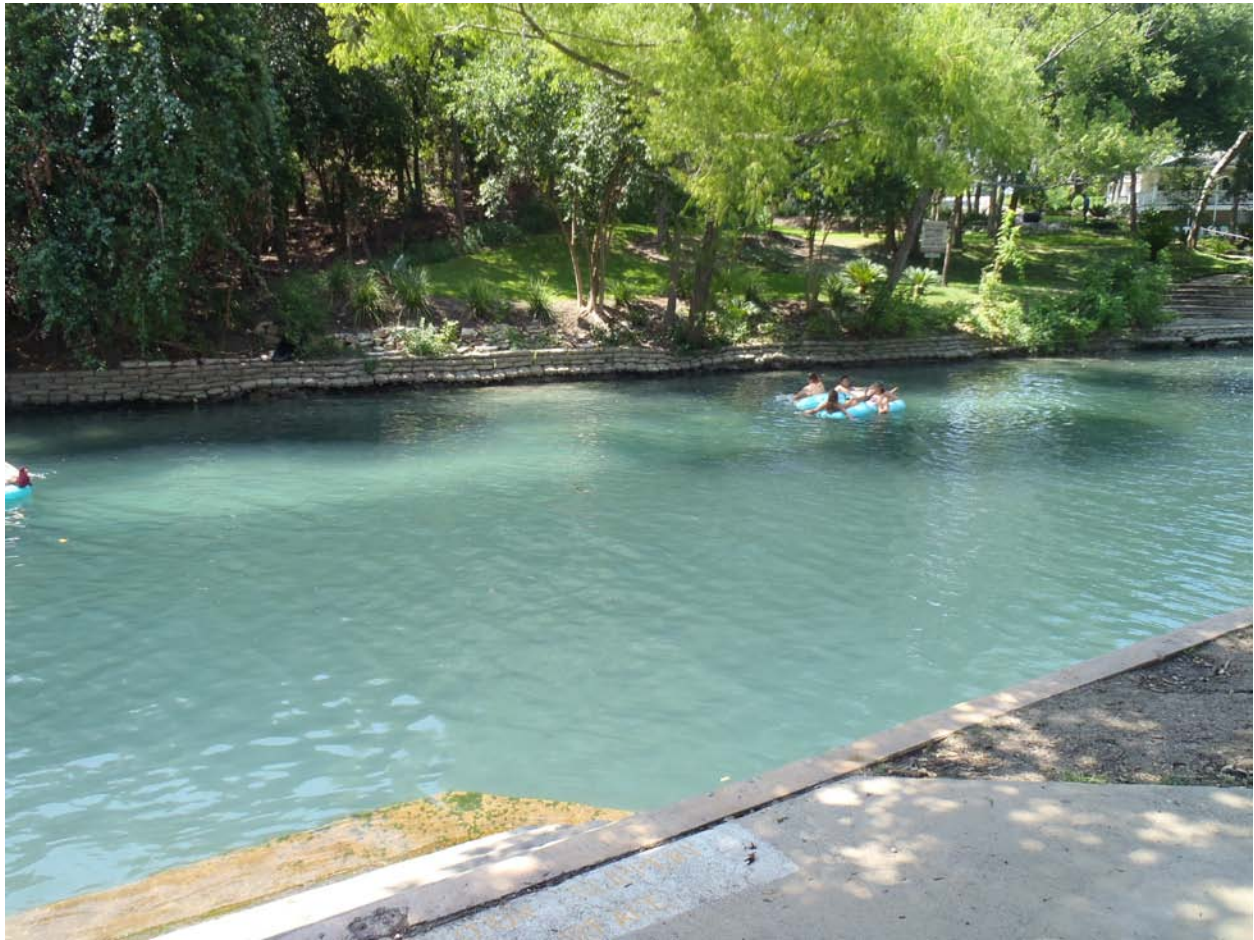
Figure 12: New Channel Cabomba continues to support quality fountain darter habitat.

In summary, total system discharge in the Comal System is passing levels that have not been witnessed since 1996. If the downward trend continues, these lower discharges will continue to create worsening surface habitat conditions each week for the Comal Springs invertebrates. The good news continues to be that the overall system continues to support quality fountain darter habitat conditions throughout most of its entirety even after nearly 4 months. Whether the fringes of the system are approaching a tipping point or will continue to hold fast is the very reason the Critical Period monitoring program (both HCP species specific and full Critical Period events) is in place. It is vital to keep tracking the success of the surface dwelling invertebrates as surface habitat continues to decline at Comal Springs. To supplement the species-specific sampling, the full Critical Period sampling event triggered this week should provide some excellent data on overall system conditions.