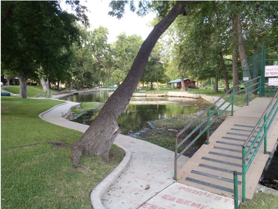
Figure 10: Continued exposed surface habitat adjacent to Spring Island.