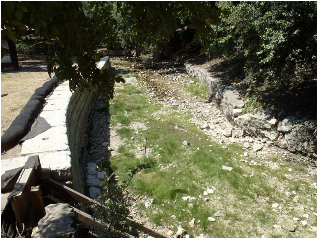
Figure 4: Spring Run 1 main channel looking downstream from Figure 3.