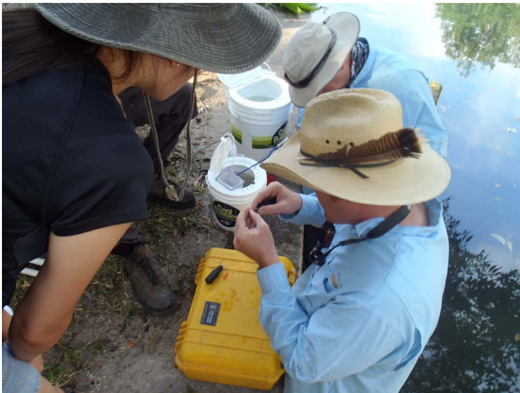
Figure 9: Fountain darter marking activities – lovely turkey feather in hat 😊.