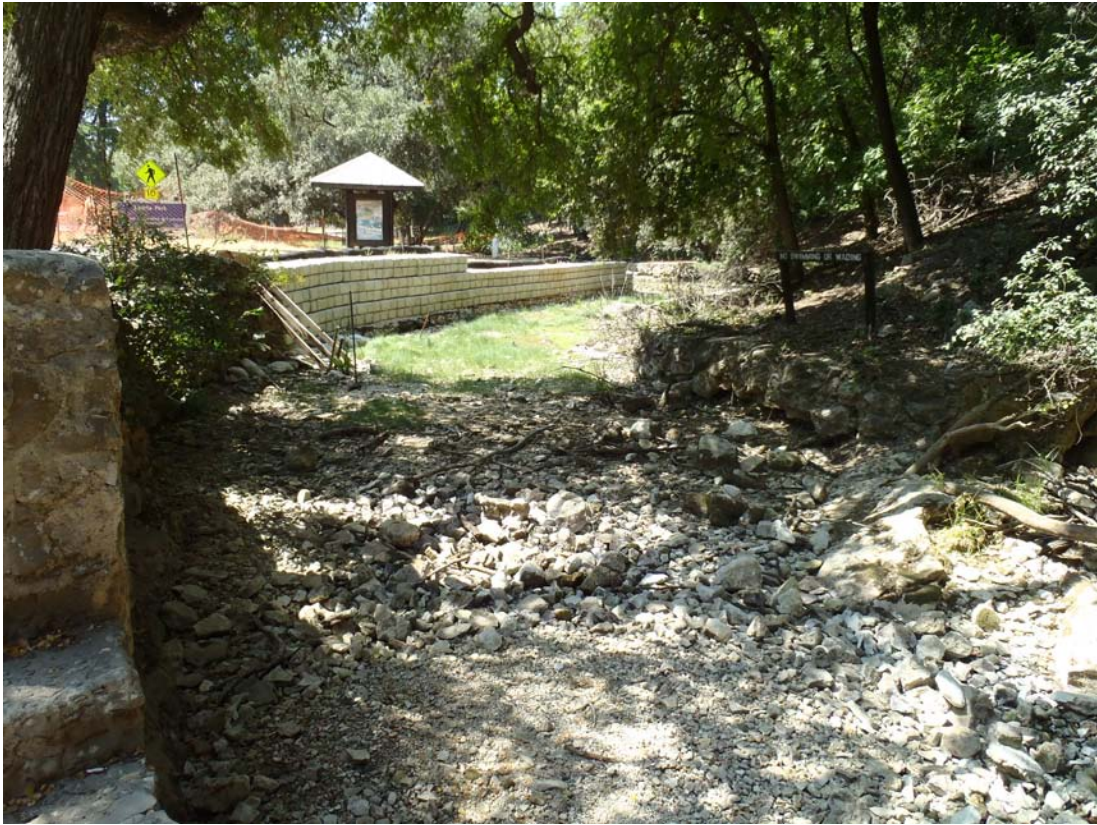
Figure 3: Spring Run 1 main channel looking downstream from main orifices.