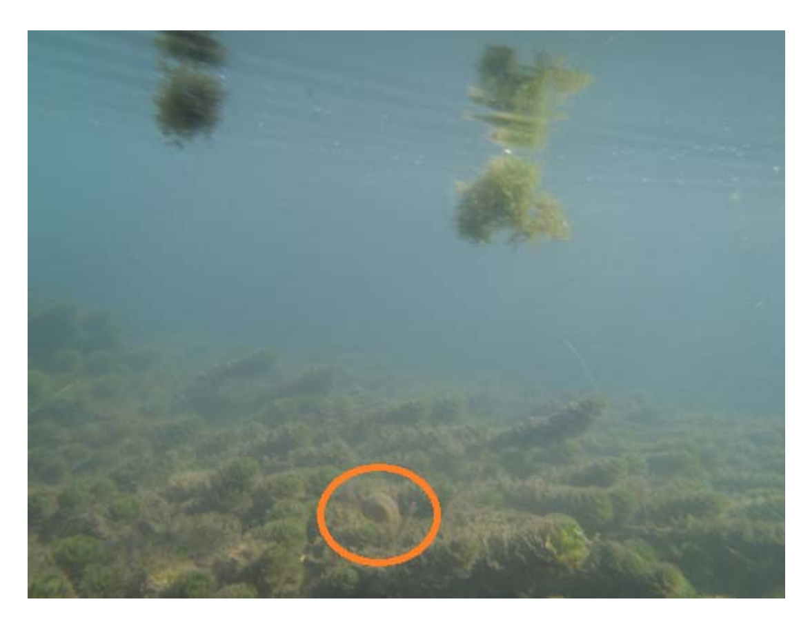
Figure 5: Non-native ramshorn snail hanging out in restored Cabomba in Landa Lake.