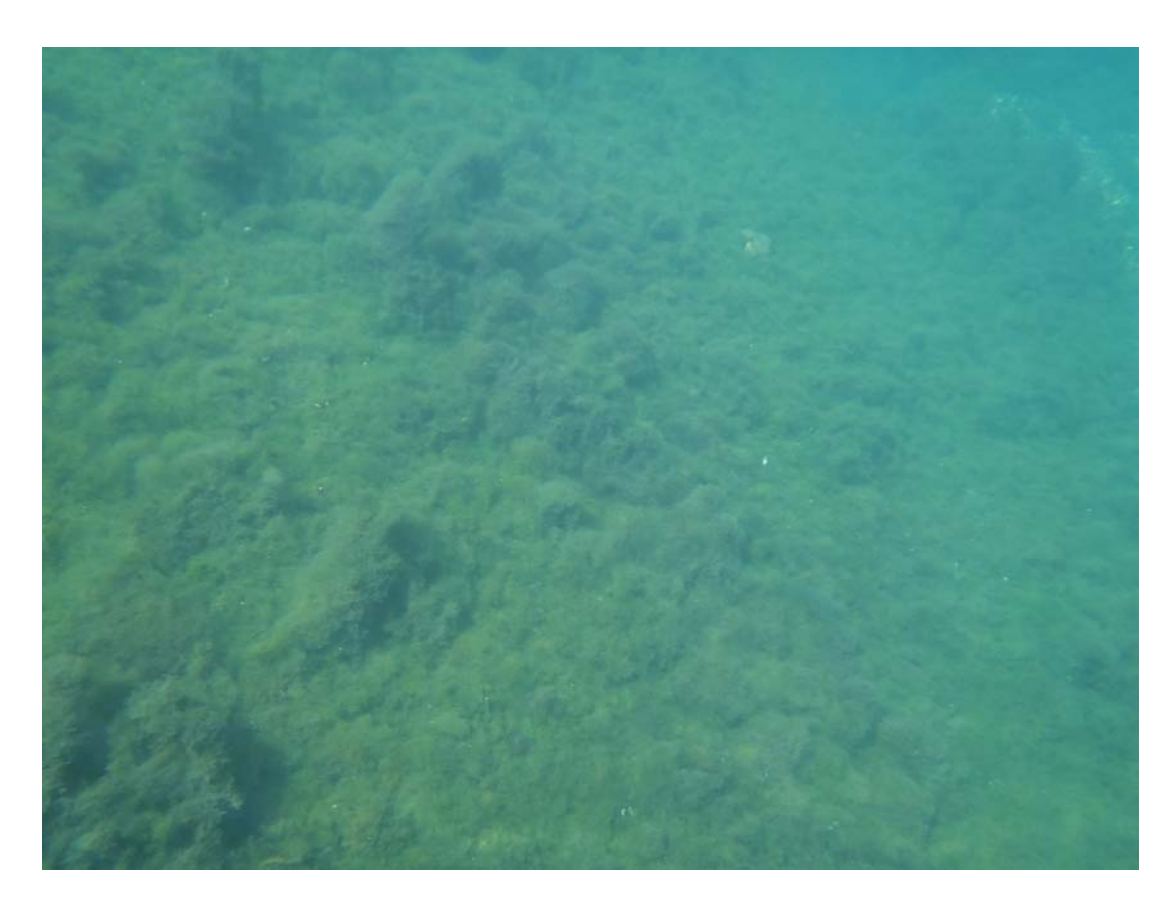
Figure 3: Extensive fields of bryophytes in Landa Lake.