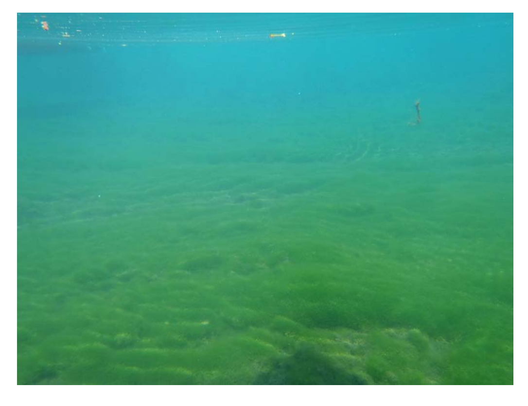
Figure 8: Underwater view of green algae covering bryophytes in portions of Landa Lake.