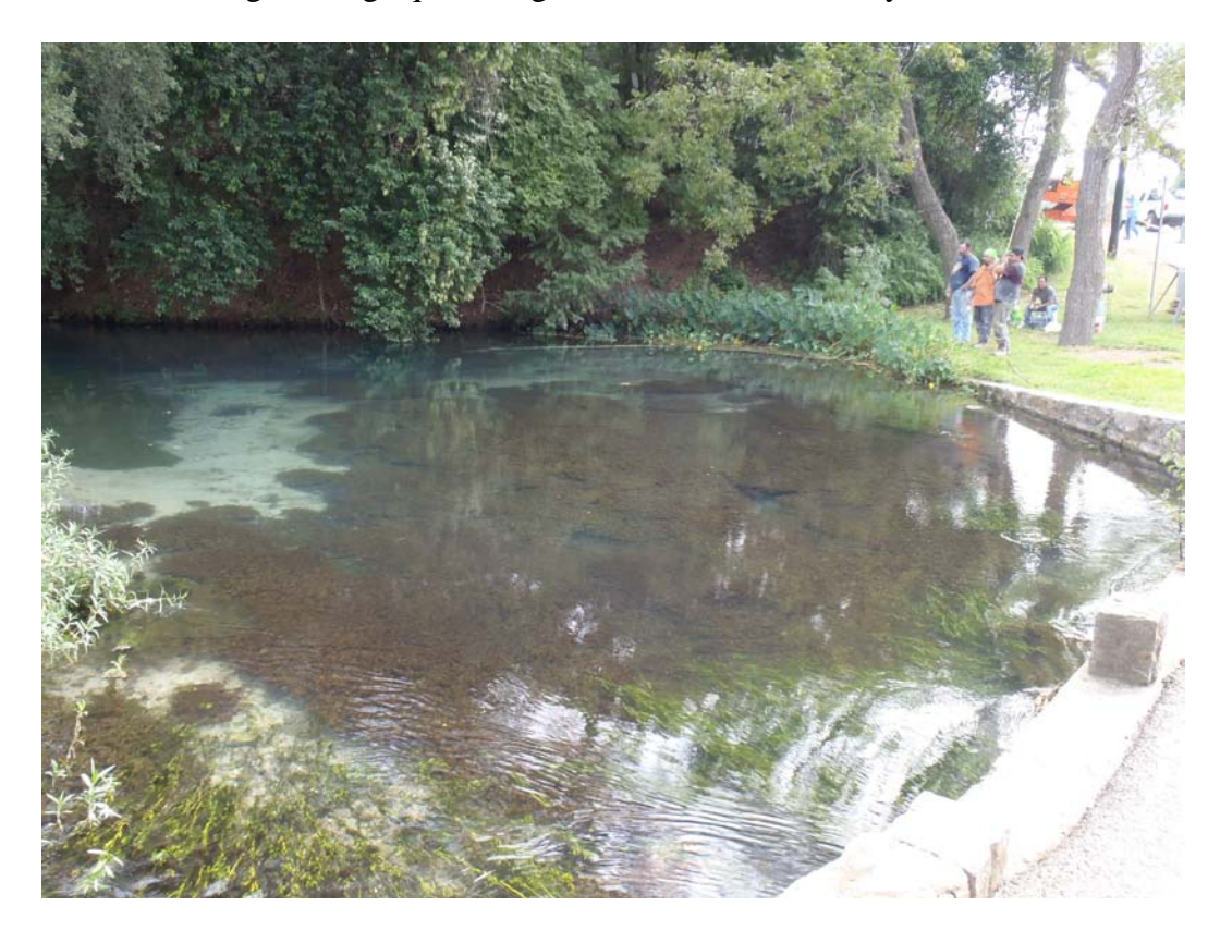
Figure 10: Restored native aquatic vegetation in Old Channel.