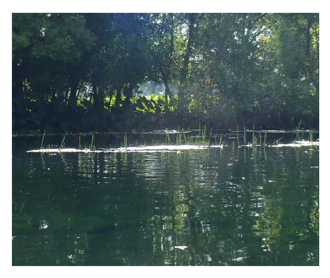
Figure 7: Shallow water depths in Landa Lake with emergent vegetation and green algae.