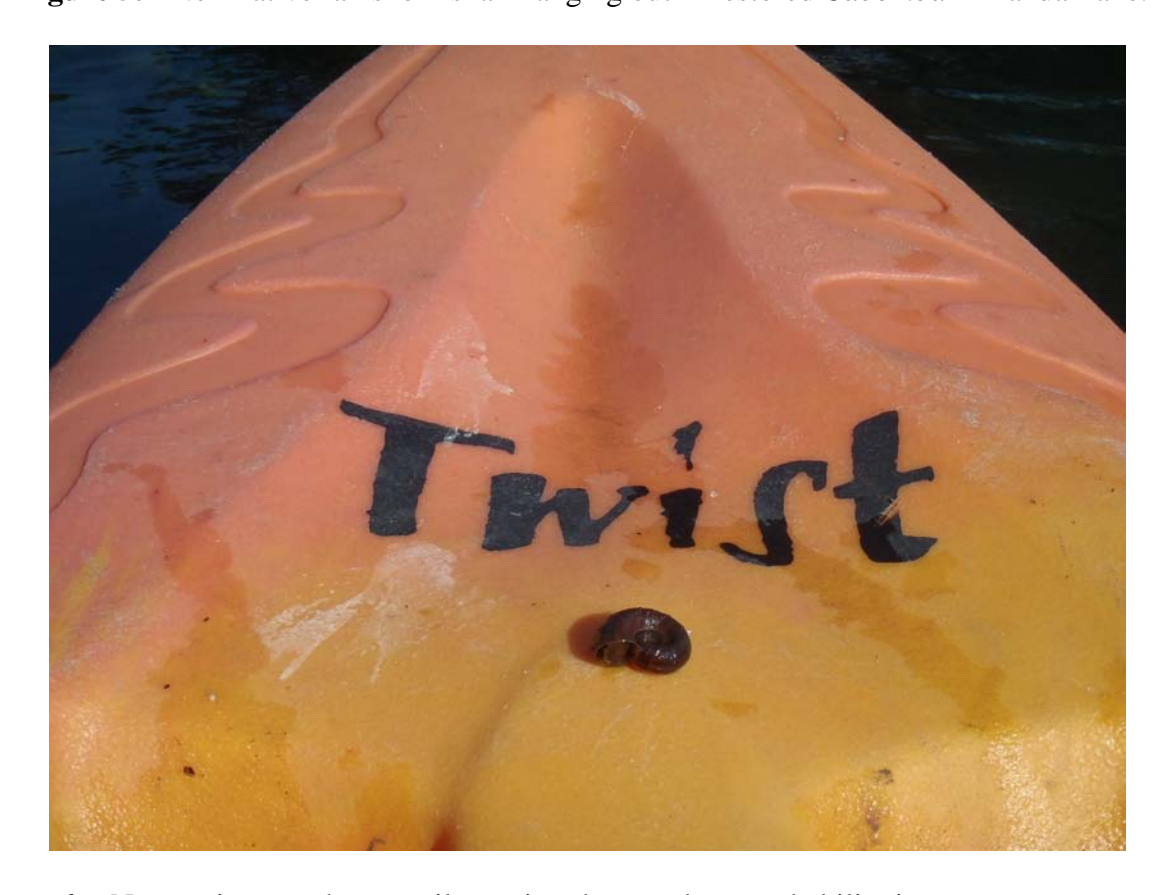
Figure 6: Non-native ramshorn snail entering the mandatory rehabilitation program.