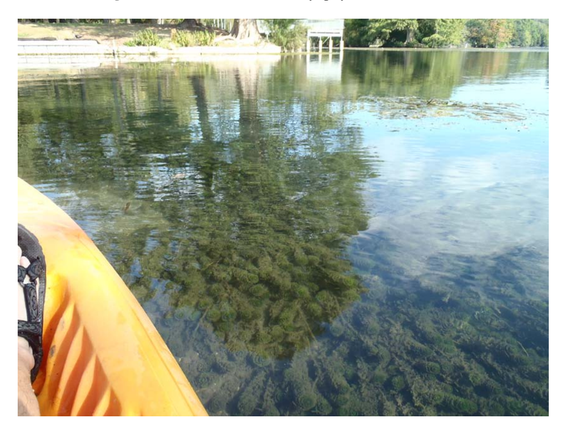
Figure 4: Restored Cabomba adjacent to the newly constructed wall in Landa Lake.