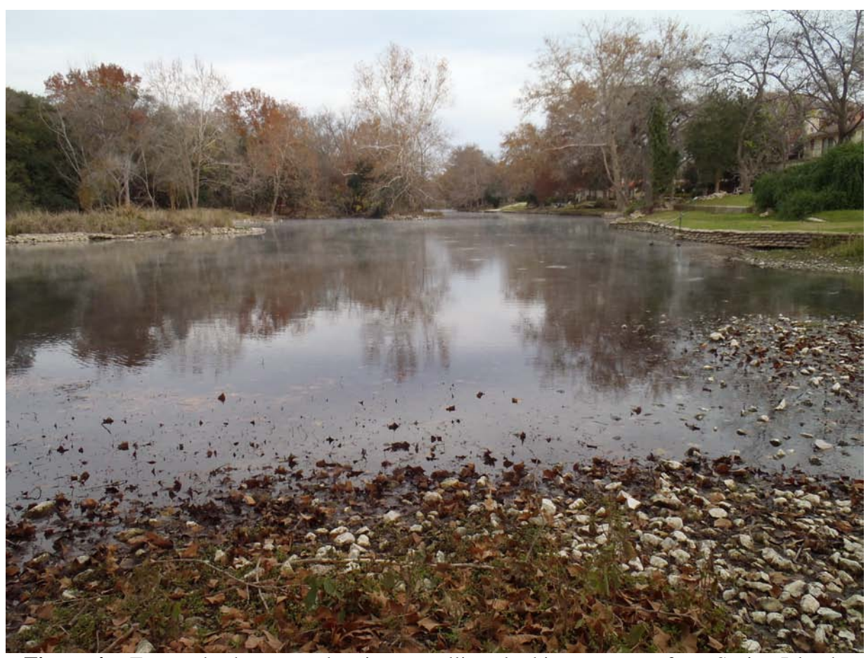
Figure 4: Exposed substrate and spring upwellings looking upstream from Spring Island.