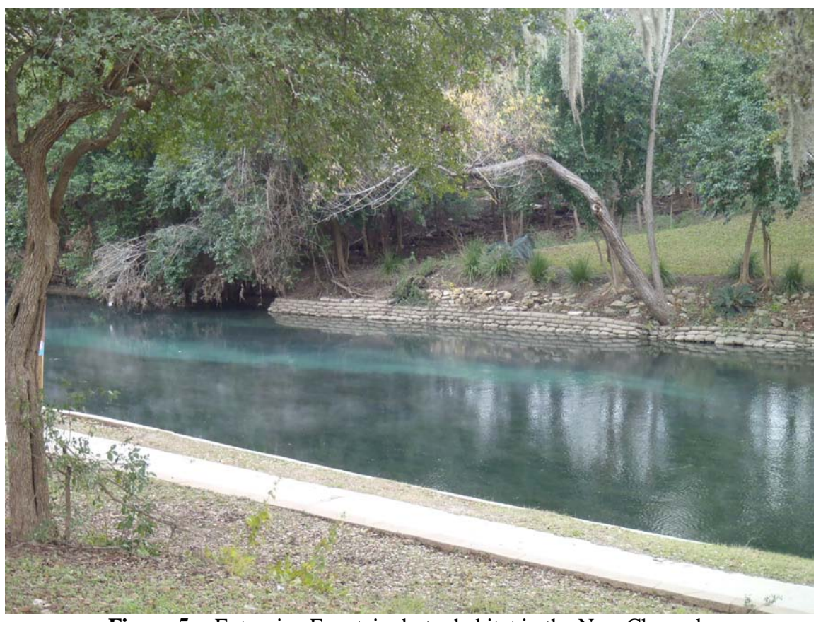
Figure 5: Extensive Fountain darter habitat in the New Channel.