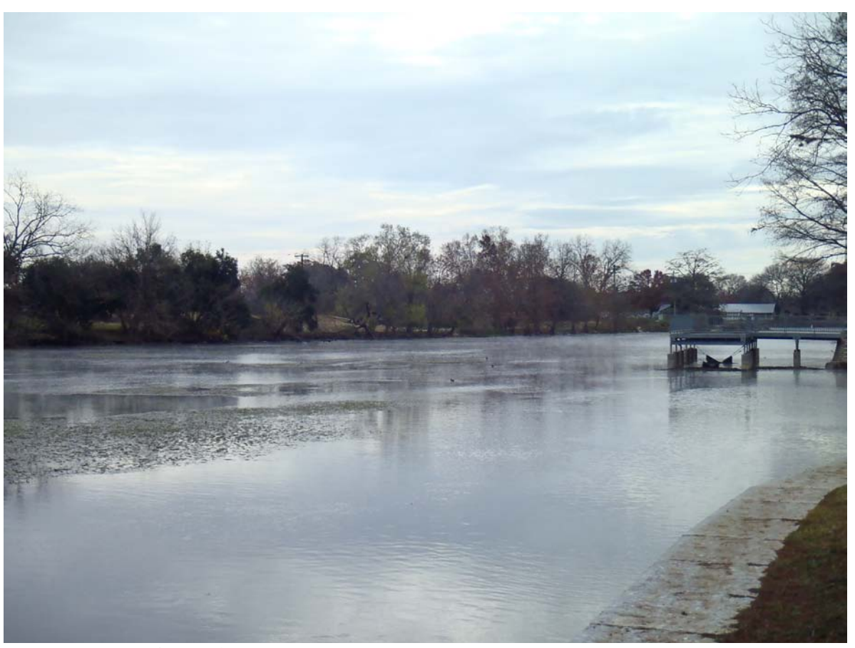
Figure 4: Floating vegetation mat condition in Landa Lake.