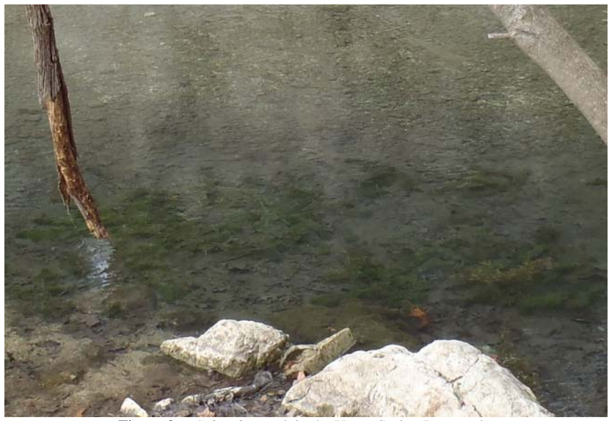
Figure 3: Cabomba patch in the Upper Spring Run reach.