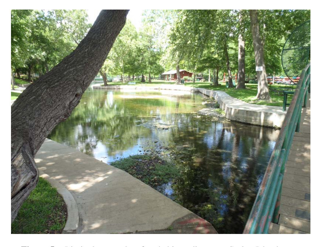
Figure 5: Limited exposed surface habitat adjacent to Spring Island area.