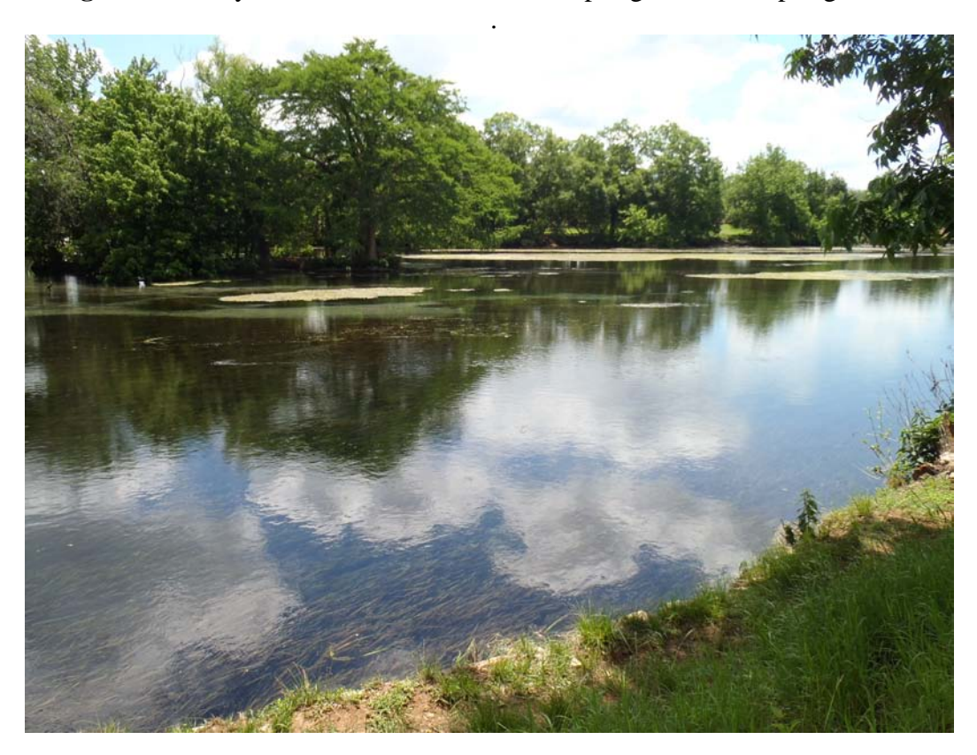
Figure 7: Floating vegetation mat condition in Landa Lake.