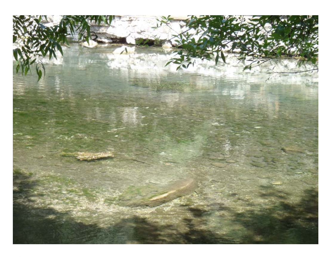
Figure 4: Upper Spring Run reach mix of bryophytes, macrophytes and only limited algae.