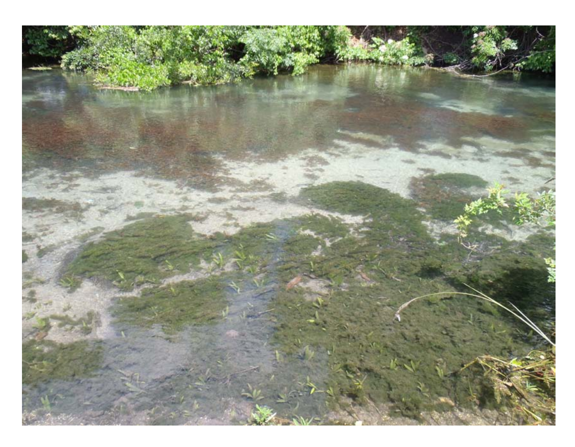
Figure 8: Restored fountain darter habitat in the Old Channel.