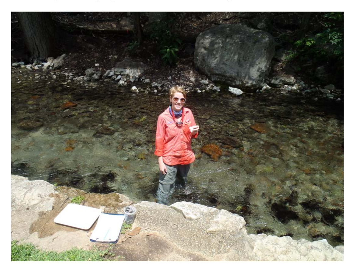
Figure 7: Checking and replacing cotton lures for riffle beetles in Spring Run 3.