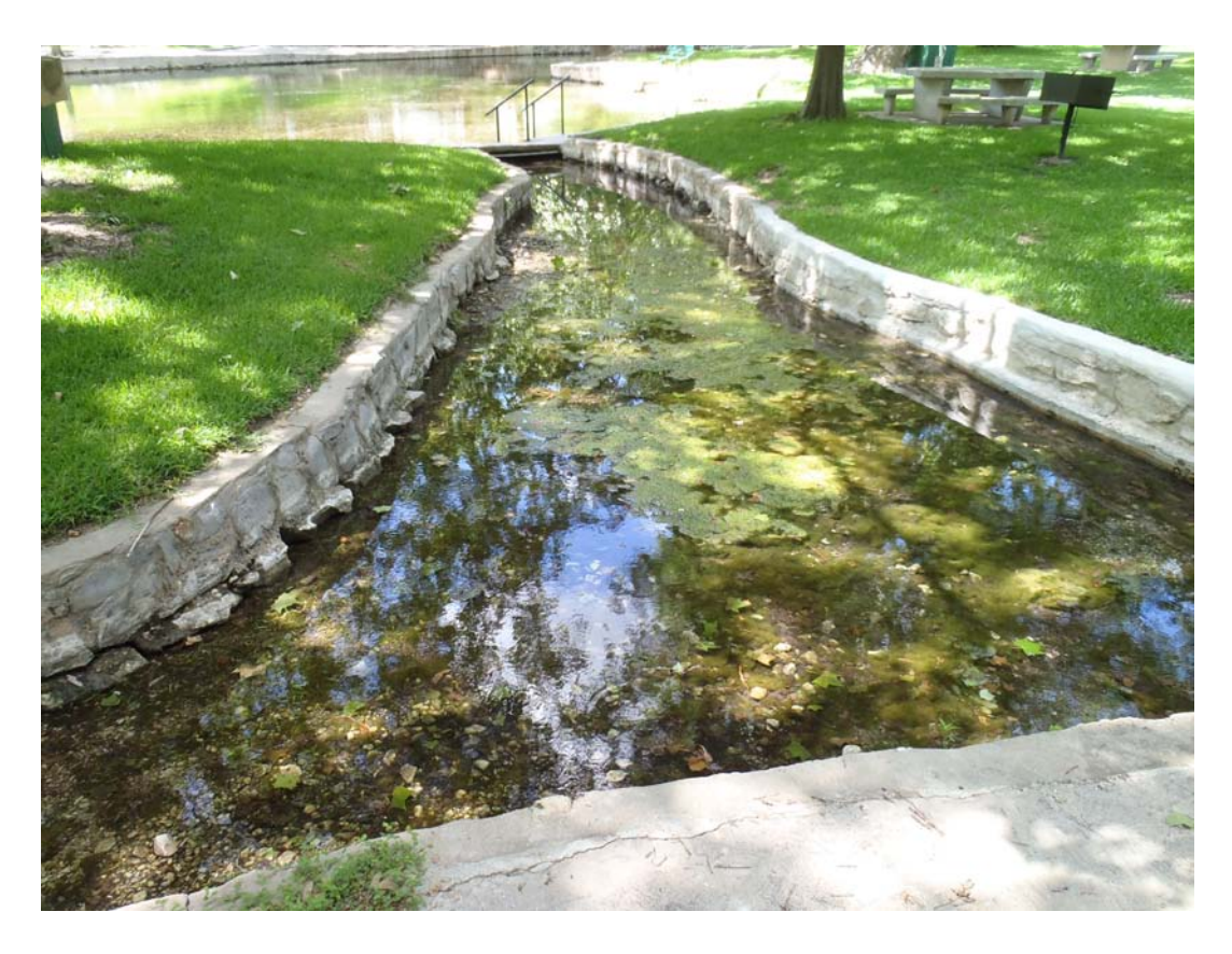
Figure 6: Fully wetted southern channel of Spring Run 6 on Spring Island.