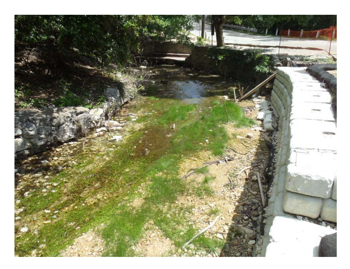
Figure 2: Spring Run 1 main channel with expanded surface flow.