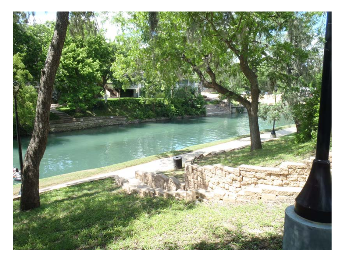
Figure 9: Slightly turbid conditions in the New Channel from Dry Comal Creek.