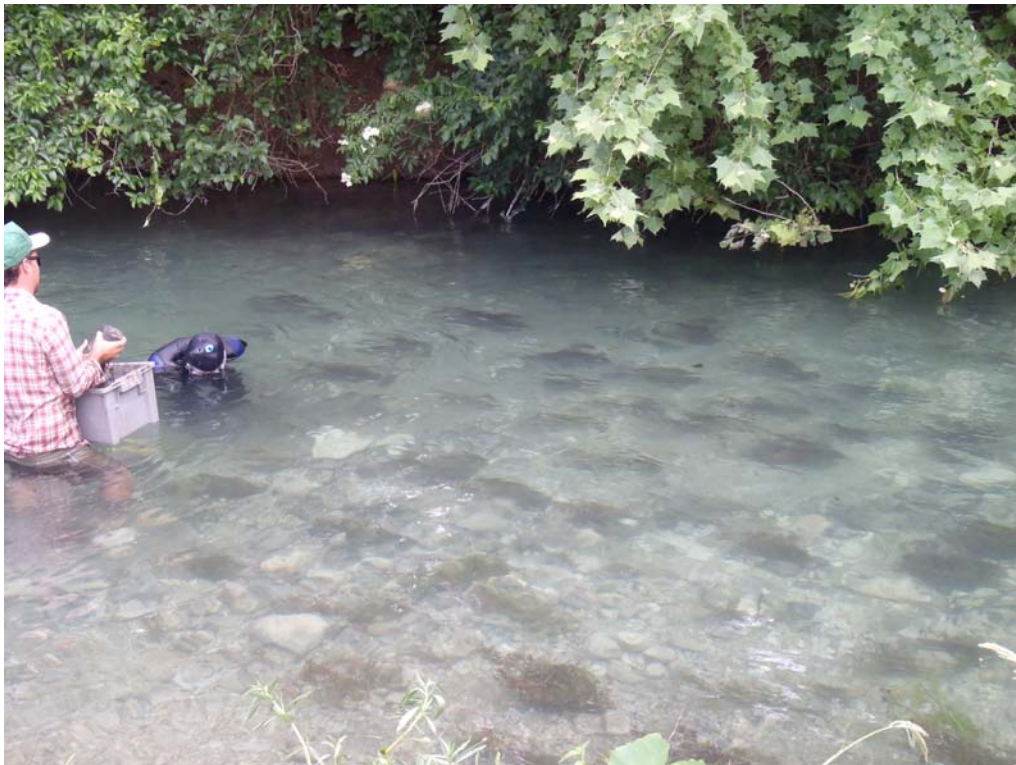
Figure 11: After Picture (Native Ludwigia from Landa Lake MUPPT nursery being planted in the cleared section of the Old Channel).