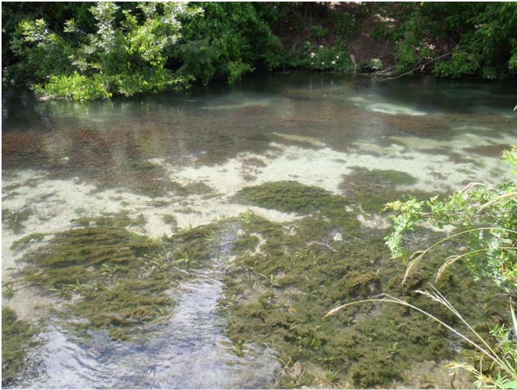
Figure 8: Restored fountain darter habitat in the Old Channel.