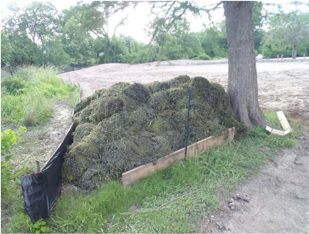
Figure 10: Extensive Hygrophila relocated to the bank.