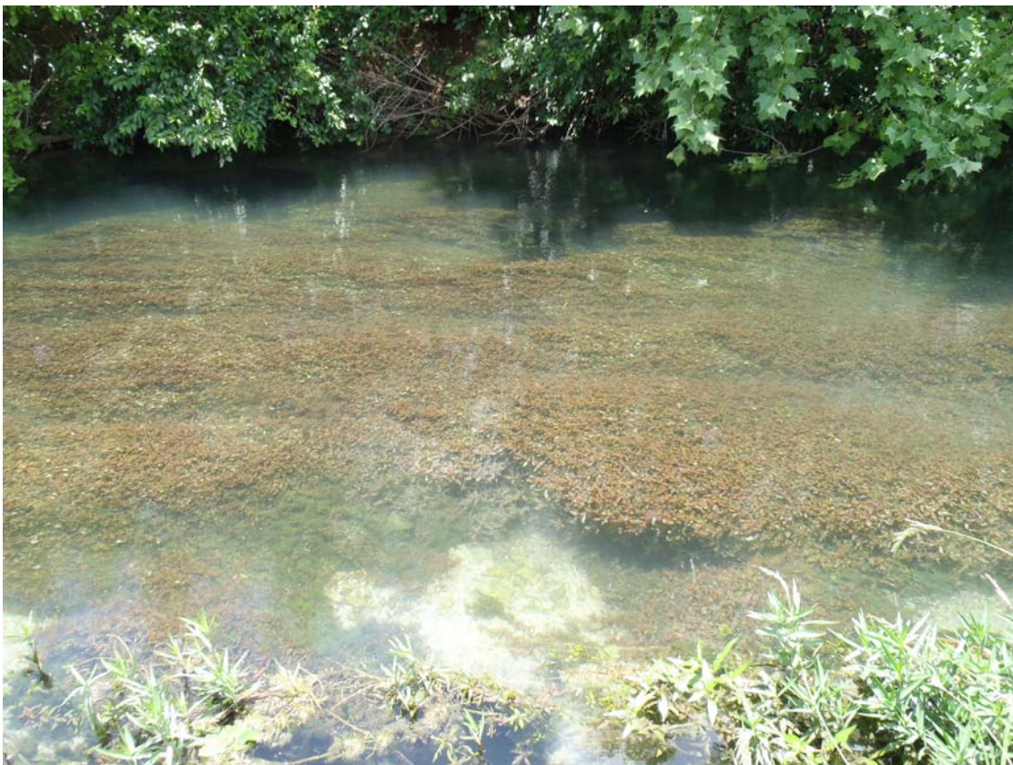
Figure 9: Before picture (extensive Hygrophila [non-native] in the Old Channel).