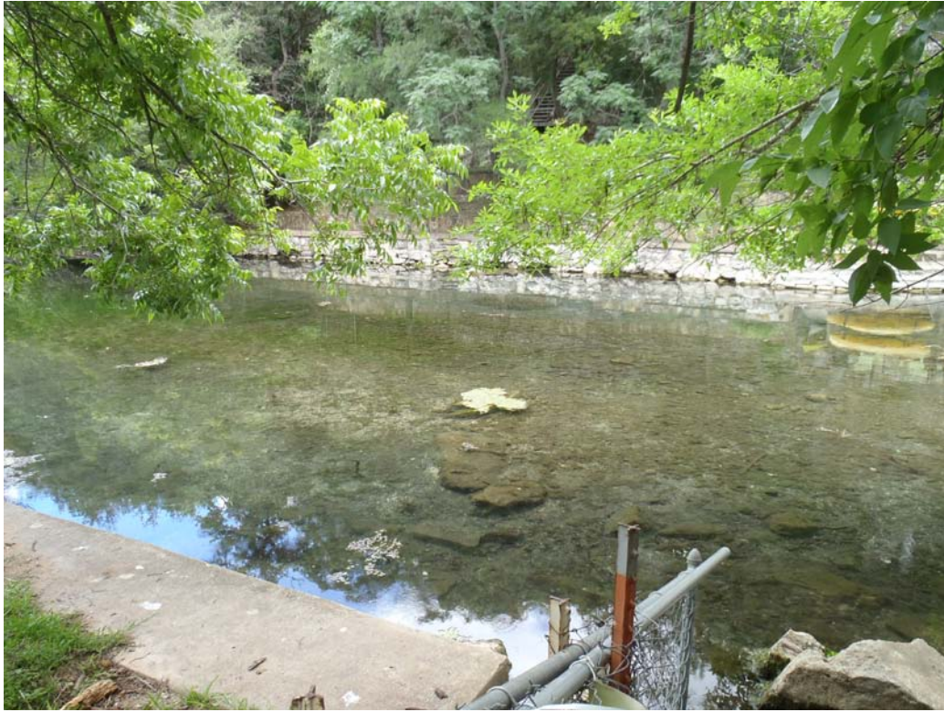
Figure 4: Upper Spring Run reach mix of bryophytes, macrophytes and slightly increasing algae.