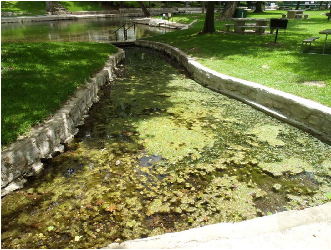
Figure 6: Southern channel of Spring Run 6 (surface algal build-up and grass clippings).