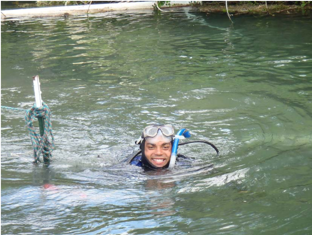
Figure 12: End result – smiles!