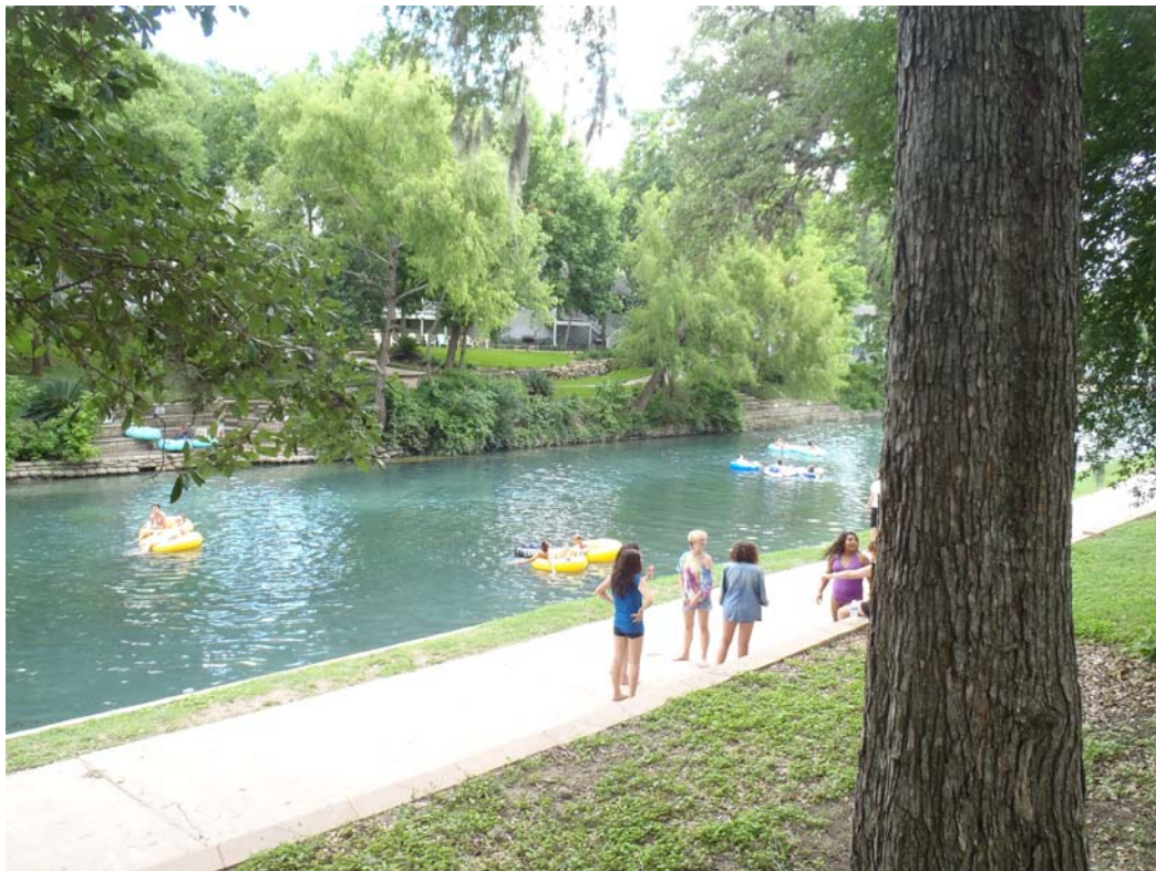
Figure 13: Extensive aquatic vegetation and a few tubers in the New Channel.