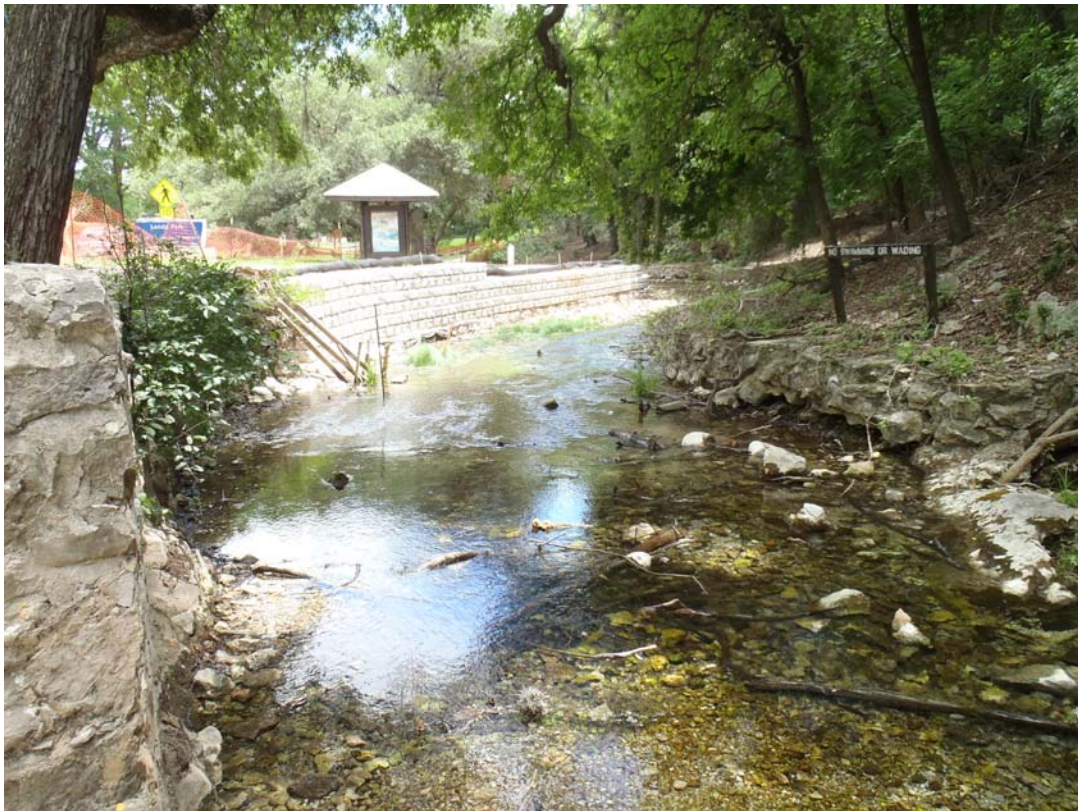
Figure 3: Spring Run 1 main channel looking downstream from main orifice.