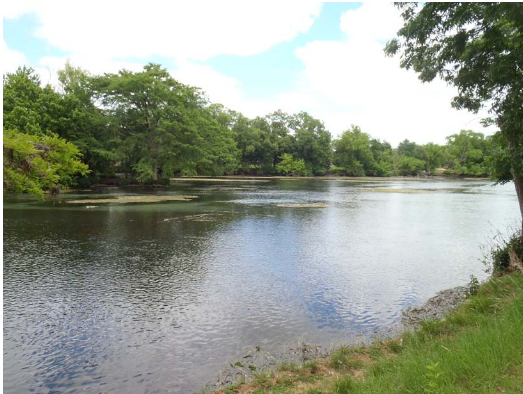
Figure 7: Floating vegetation mat condition in Landa Lake.