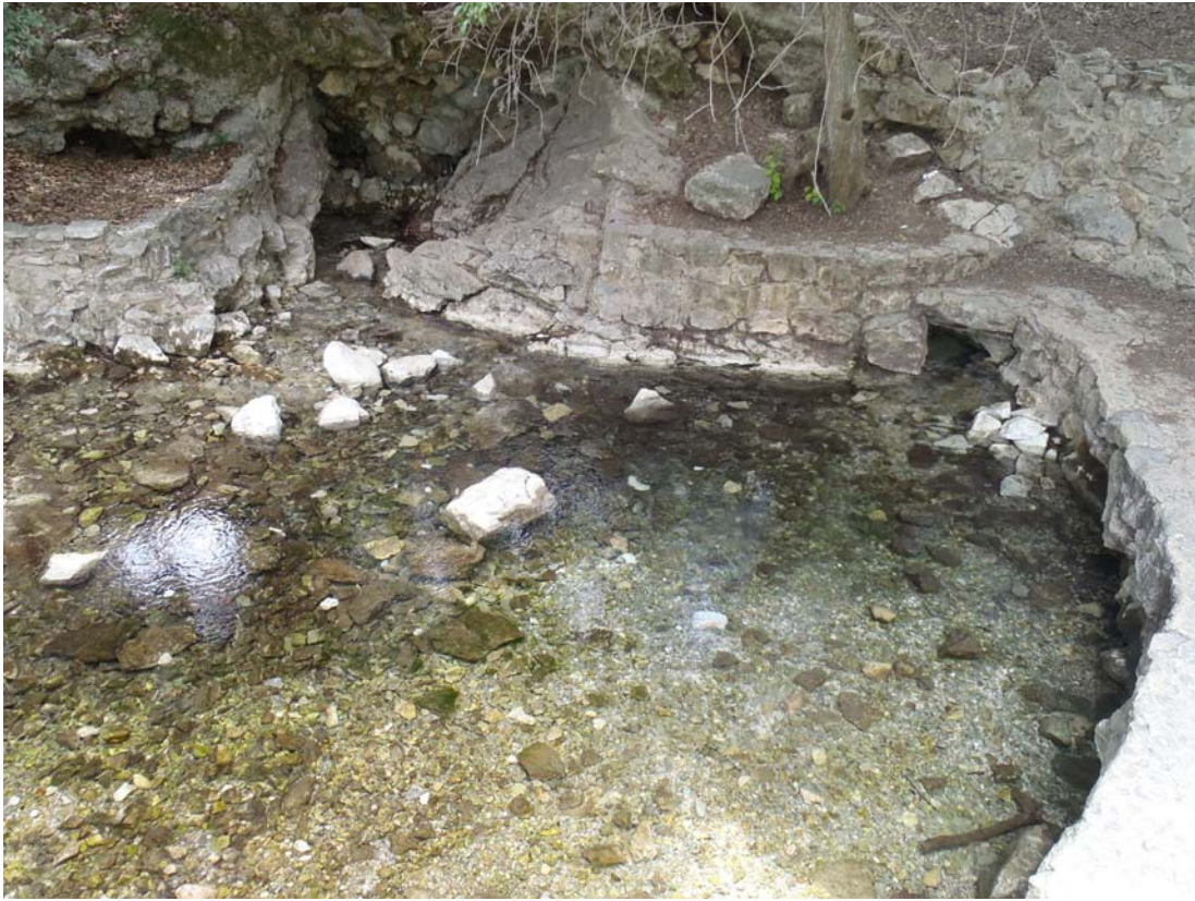
Figure 2: Spring Run 1 main orifices.